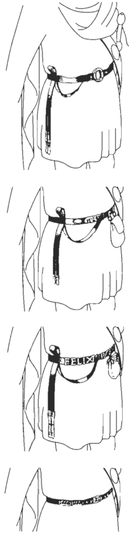
Figure 3 Reconstructions of mid-third century AD military belts, based on archaeological finds from Dura-Europos, Syria, tomb groups from Europe and representational data such as Figure 2. The waist-belt was very often (but not always) extended into a long swag to the right hip, and hung down the right thigh, terminating in a pair of terminals, sometimes heavy and perhaps hinged, which would clash as the soldier moved. The uppermost example shows the ring-buckle, a common form but in this case the ring, and attendant studs and strap-terminals, are of ivory. The fittings on the other examples are copper alloy. (Drawn by Simon James).