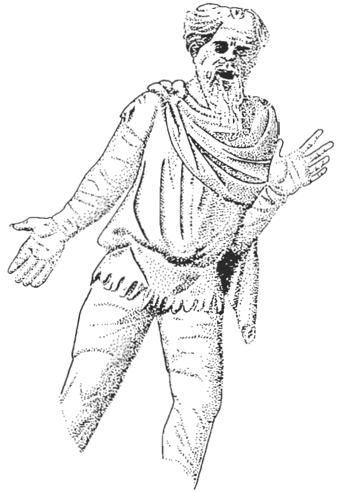
Figure 5 A 'barbarian' from the Column of Marcus Aurelius, later second century AD. He wears a version of the (specifically free?) male dress common across much of Europe north of the Mediterranean world: long breeches, long-sleeved tunic and cloak fastened at the right shoulder. Compare with Figures 4 & 2. (Drawn by Simon James, after Caprino et al. 1955, Scene LXVIII, Tav. O).

clothing traditions of the Mediterranean core, but those of the provincial periphery and beyond: the standard 'barbarian' dress of the North and East had displaced Italian garments. Instead of a simple tunic which left the limbs bare, and various types of cloak (Figure 4), the soldiers now wore essentially the same garments as males (at least, free warrior males?) of the peoples along and beyond the frontiers; long-sleeved tunics, long trousers, and the northern blanket-cloak (Figure 5).