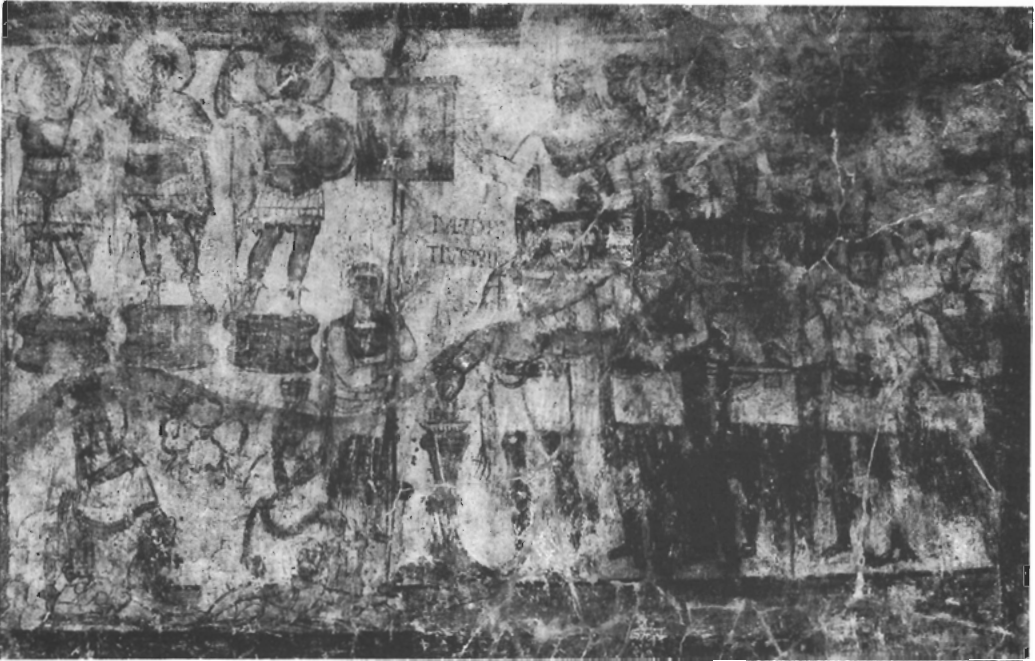
Figure 1 Painting from the Temple of Bel, Dura-Europos, Syria, showing Roman soldiers of cohorts XX Palmyrenorum attending a sacrifice. Note the swagged belts, white tunics with (now faded, but visible) purple trimming, dark breeches and cloaks (brown except for officers). Probably AD230s.

actions of a group, the emotional power of this process of 'entrainment' can be enormous, and is key to understanding how the sense of solidarity in a group, especially one facing physical dangers, is established and maintained (Ehrenreich 1997:184).