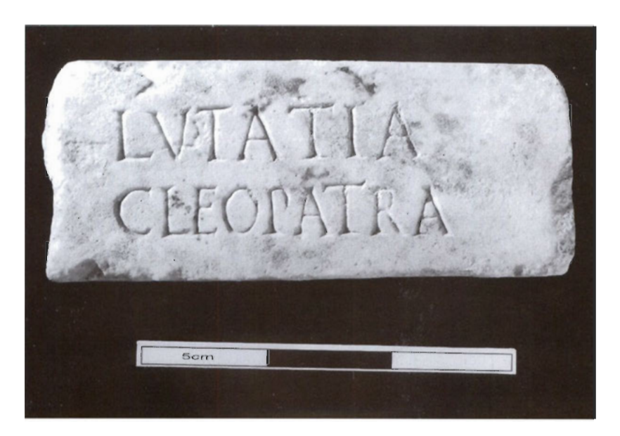
Figure 2. Fragment of an inscription.