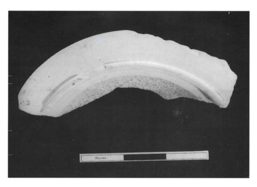
Figure 1. Fragment of a mortarium.