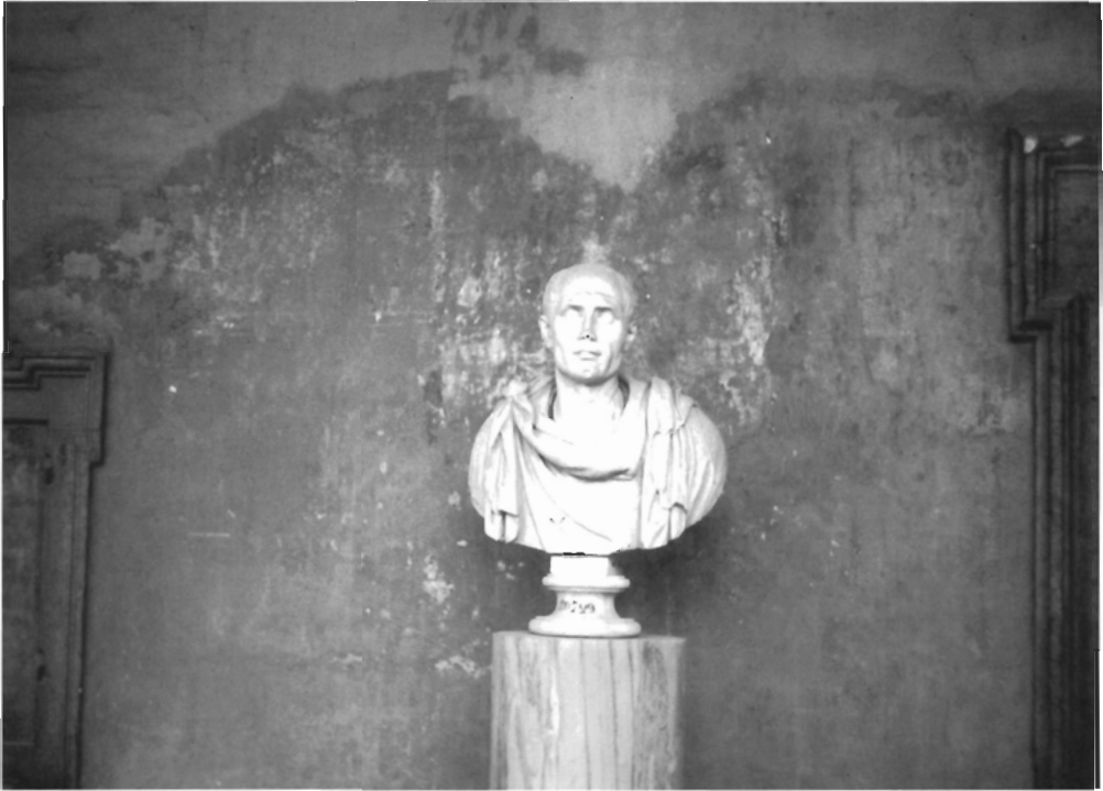
Figure 1. Portrait bust of unknown Roman male. Museo del Palazzo dei Conservatori, Rome.

Of course, modern sensibilities with regard to accidentally broken ancient artworks or those damaged through iconoclasm are not principally the issues under discussion here, interesting though they undoubtedly are (Nylander 1998).