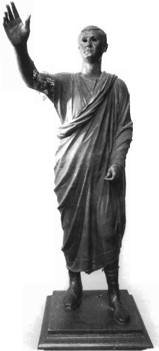
Figure 6. Bronze statue of Aulus Metellus, the 'Arringatore'. Museo Archeologico, Florence.