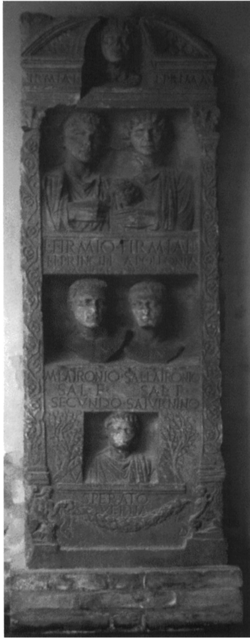
Figure 4. Grave relief of freedman and family members. Museo Nazionale, Ravenna.