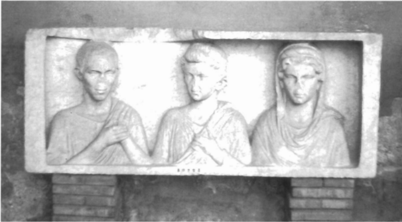
Figure 5. Grave relief of Roman family group. Museo del Palazzo dei Conservatori, Rome.

Nochlin discussed occasions during the French Revolution in which “both outright vandalism” and a kind of “recycling of the vandalised fragments of the past for allegorical purposes” (Nochlin 1994: 8) took place. “The imagery-and the enactment-of destruction, dismemberment and fragmentation remained powerful elements of Revolutionary ideology at least until the fall of Robespierre in 1794 and even after” (Nochlin 1994: 10). Underlying what simply may be viewed as iconoclasm were several sets of deeply felt tensions – between the act and action, between image and reality, and between tradition and modernity.