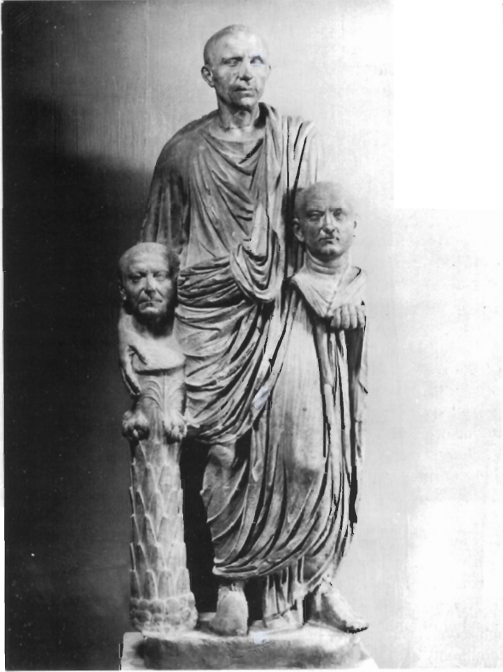
Figure 2. The so-called Barberini togatus statue, Museo del Palazzo dei Conservatori, Rome.

Recently Mary Beard and John Henderson (Beard and Henderson 2001: 207) have noted in their volume on classical art in the Oxford History of Art series that “it was an emphatically Roman, rather than Greek, drive to surround available living-space with armies of abbreviated figures of prestige-heads or busts; and to leave the western world with a collective acceptance of the convention of representing persons from the neck up.” Although this is not an original observation, it is interesting that this Roman innovation is still deemed worthy of comment in this way.