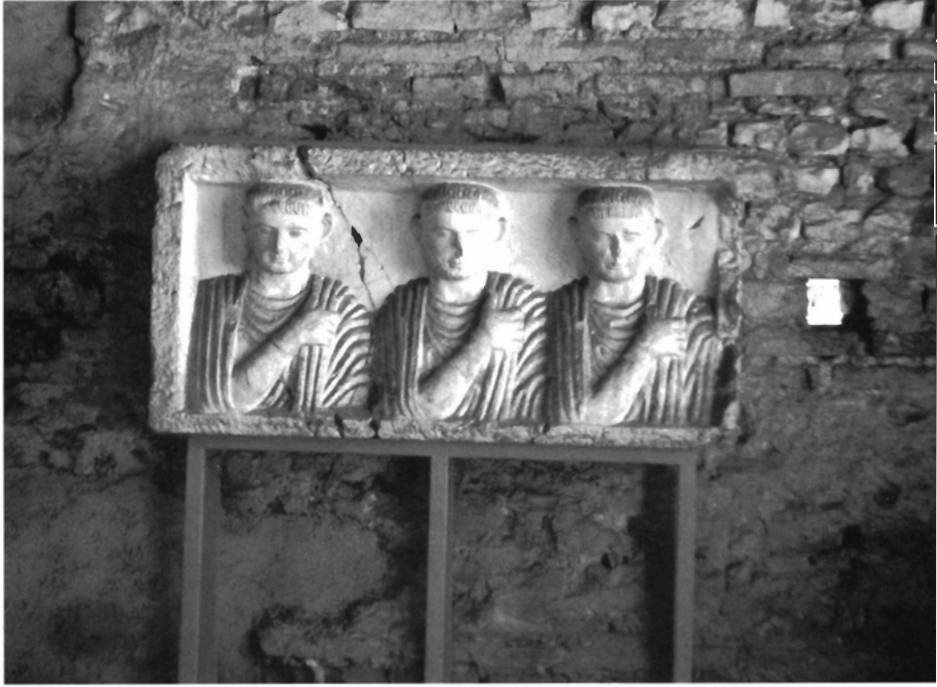
Figure 3. Grave relief of unknown freedmen. Museo Romano di Brescia.

There may certainly be some links between Etruscan and Italian belief systems and later Roman practices (Gazda 1973; Damgaard Andersen 1993). Stefano Bruni (2000: 368–369) has discussed a specific link between death rites and artistic representation at Vulci in the seventh century BC when composite statues made up of assembled parts, often made in different materials, appeared. These “recompose the image of the deceased, which is ‘de-structured’ as a result of the particular treatment to which the body was submitted” (Bruni 2000: 369), in this instance cremation. “They give monumental expression to the same ideology as that expressed by the sealed cinerary urns with lids in the form of the human body, which were typical of this area from the last quarter of the eighth century to the middle of the seventh century BC”.