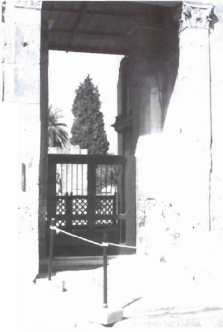
Figure 2. Domus of Lucius Caius Secundus, I.vi.15, Pompeii