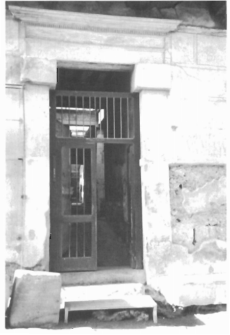
Figure 3. Casa del Fauno, VI.xii., Pompeii