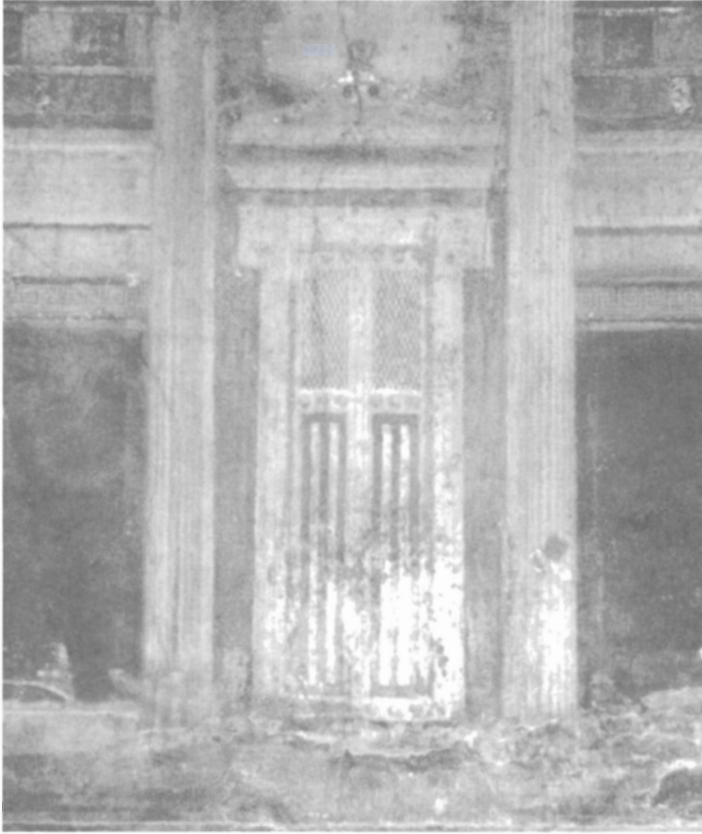
Figure 6. Wall painting from the Villa dei Misteri.

Doors and doorways are a common motif found on sepulchral sculpture in many parts of the empire from Italy (Lawrence 1928: 433; Lawrence 1958: 273–274), France (Toynbee 1971: 247) to the so-called Asiatic sarcophagi (Lawrence 1928: 421). These representations presumably have a symbolic value connected with death (Haarløv 1977) but they are still characteristic of doorways in a functional sense as they are similar in form and decoration to portals found on wall paintings. The remains and embellishments that survive in Pompeii and Herculaneum show that house doors may have been similarly decorated but were less ornate. If this is the case, then the preserved examples of doorways found in Pompeii and Herculaneum are not unique to the region of Campania, but similar forms, taking into account regional variations, would have existed in other parts of the empire.