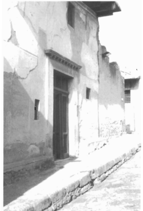
Figure 5. Casa del Tramezzo di Legno, III.11-12, Herculaneum