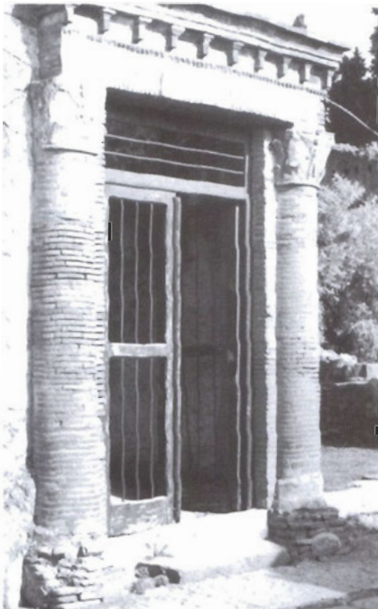
Figure 4. Casa del Gran Portale, V.8 Herculaneum