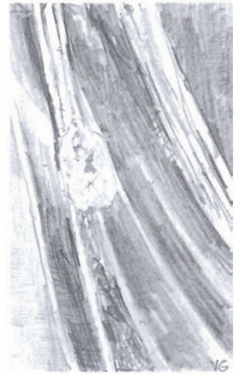
Figure 2. Hair louse preserved on hair shaft from Poundbury Camp

Many individuals from Poundbury Camp with whip- and roundworms recovered from their pelvic regions (Jones 1993: 197–8) also had osseous responses associated iron deficiency (Roberts and Manchester 1999: 165–170). Stuart-Macadam's analysis of iron deficiency at the site suggests that these anaemic responses may have been caused by the parasite infestations (1991: 103 & 105). However, the creation of an anaemic response can also be produced in order to inhibit the effects of the infestation (Ryan 1997: 51; Weinberg 1992: 135–6; Stuart-Macadam 1991: 105).