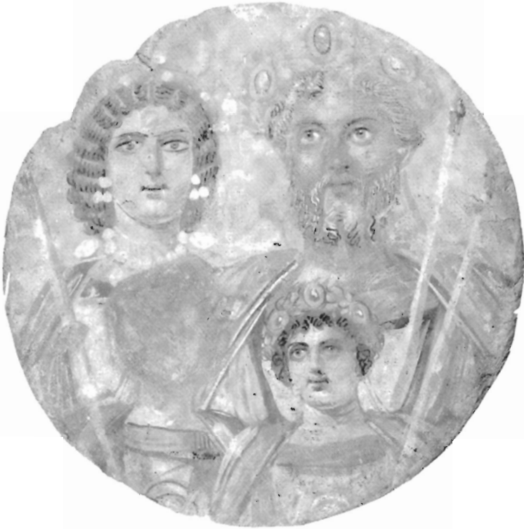
Figure 1: Painting of the Emperor Septimius Severus with his wife and two sons. Geta's face was erased after his murder by Caracalla in AD 212.

statues to the heroes of the Republic which are still standing in Rome. It should be noted, however, that even if Augustus and later emperors did not destroy statues of Republican viri illustres , they were moved from the Capitol to the Field of Mars (Haug 2001: 115). Reminders of a Republican past were thus physically removed from the centre of power, where henceforth imperial pasts were commemorated (see below).