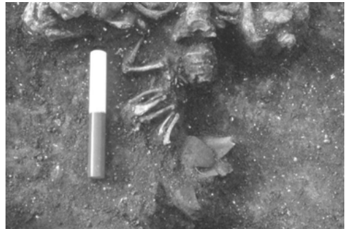
Figure 4. The chicken bones and pot sherds in position at the top of the neck.

reaction (amongst Romanists at least) is to draw a parallel with the other well known chicken-headed man from Roman Britain. There is a unique Romano-British mosaic from the Isle of Wight that famously features a figure with a chicken head. The Brading Villa mosaic shows this figure standing in front of a building, either on a hill with a path leading to it or on stilts and with a ladder providing access. Two apparent griffins appear to the right of this scene. This has been variously interpreted as an image of Gnostic importance, as Iao or Abraxas (Henig 1995: 220–221), and even as something drawn from fairytales (Ling 1991: 17). There is a fundamental difference between our two chicken-headed figures though in that the burial does not have a chicken-head but a chicken for a head. This difference is further accentuated when it is noted that the chicken used in the Baldock case is, in fact, also headless.