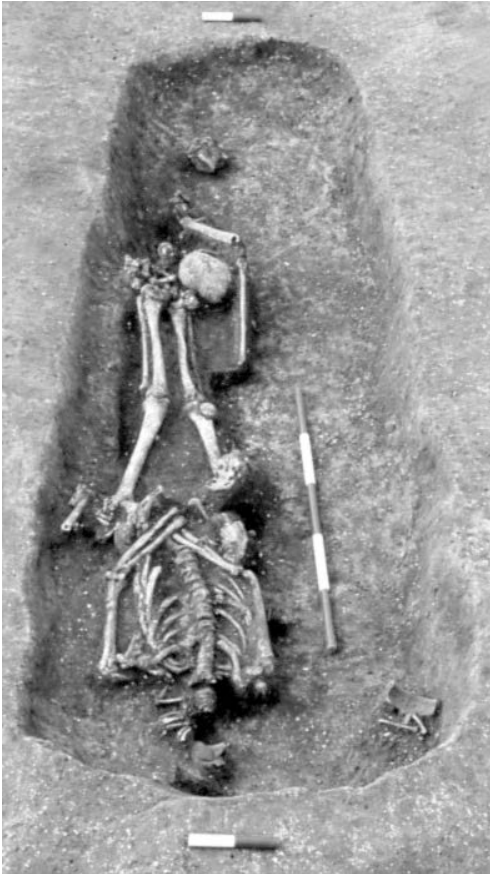
Figure 2. The unusual burial from Hartsfield School, Baldock.