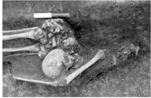
Figure 3. The head by the feet of the man and the displaced but still partially articulated remains of the earlier burial(s).