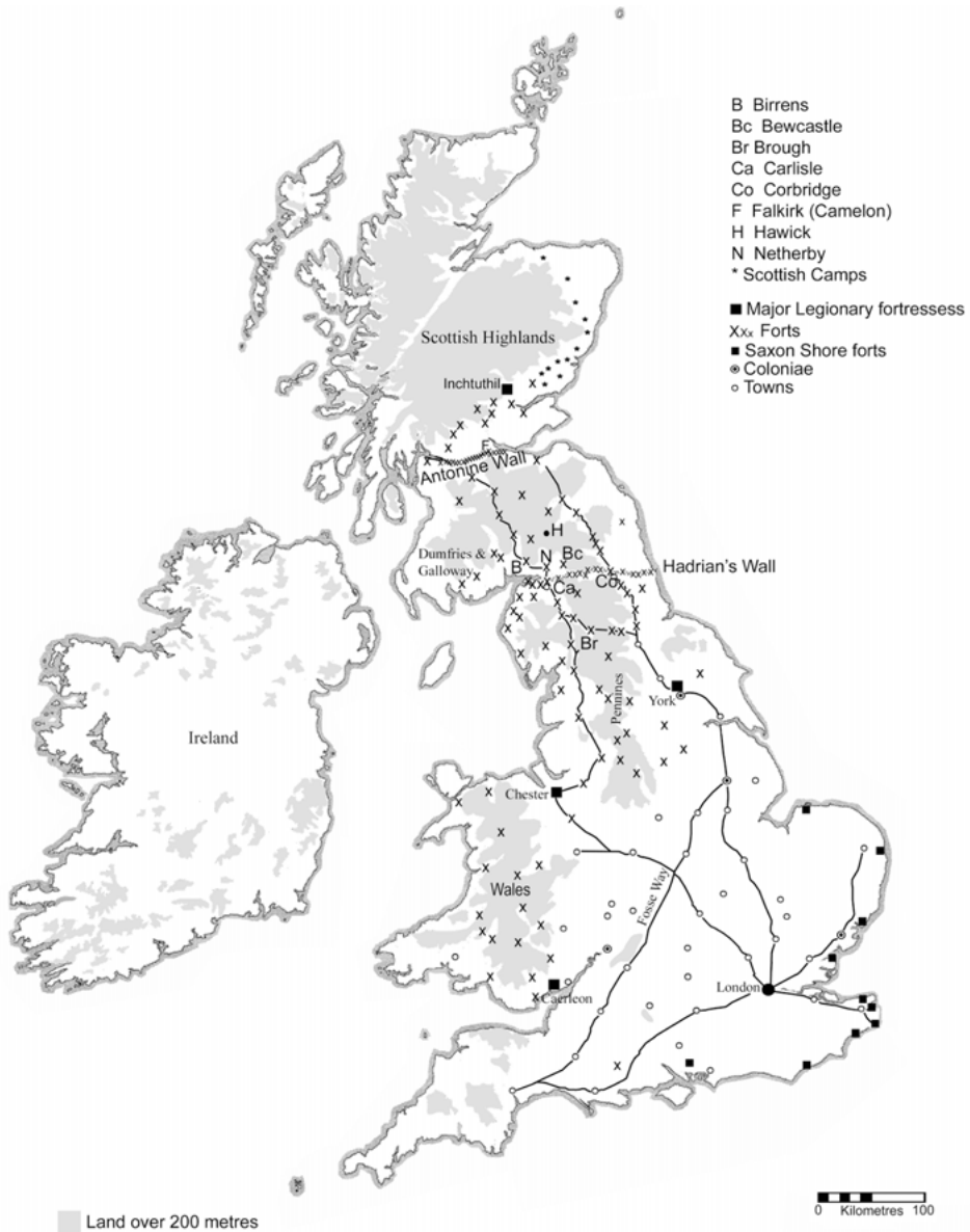
Figure 1: Generic map of Roman Britain (not valid for any specific date) showing locations mentioned in the text and the geographical distributions of main Roman roads, forts and towns.

poor preservation of organic remains and a paucity of dating evidence (Hodgson and Brennand 2006: 51–55). More data are available for the eastern part of the country but these are still affected by poor chronologies and preservation (Huntley et al. forthcoming). Some late Iron Age hillforts are attested in Northumberland (Haselgrove et al. 2006: 39) which suggests a form of