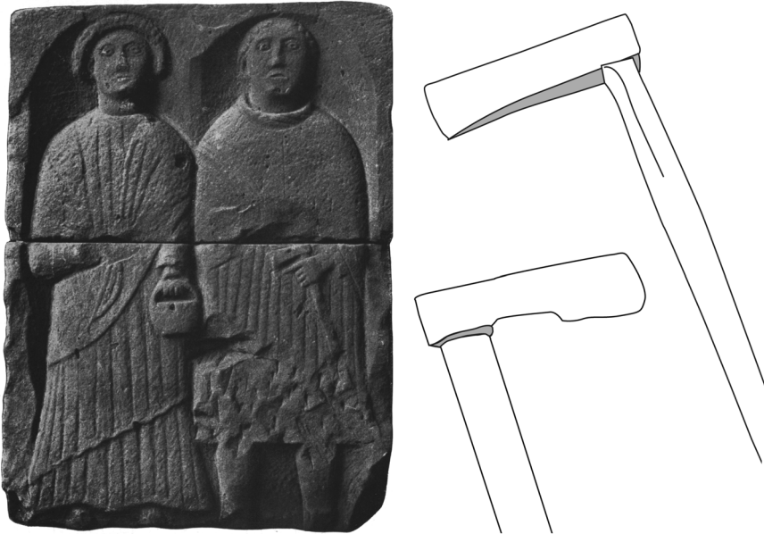
Figure 3: The relief from Waldfishbach showing a saltuarius (Sprater 1929: 64) (left). The excavated securis from the same location is shown on the upper right, with a Loogaxt below (drawings by author).