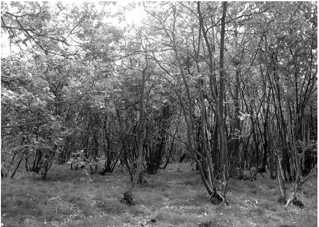
Figure 4: A coppiced oak stand at the Laarzenberg near Rhenen in the Netherlands.

Columella (IV.XXI.2–3) also mentions the practice of pollarding, and Pliny (XVI.141–142) writes on the basics of coppicing, describing how a cypress will grow again from the roots after it is felled.