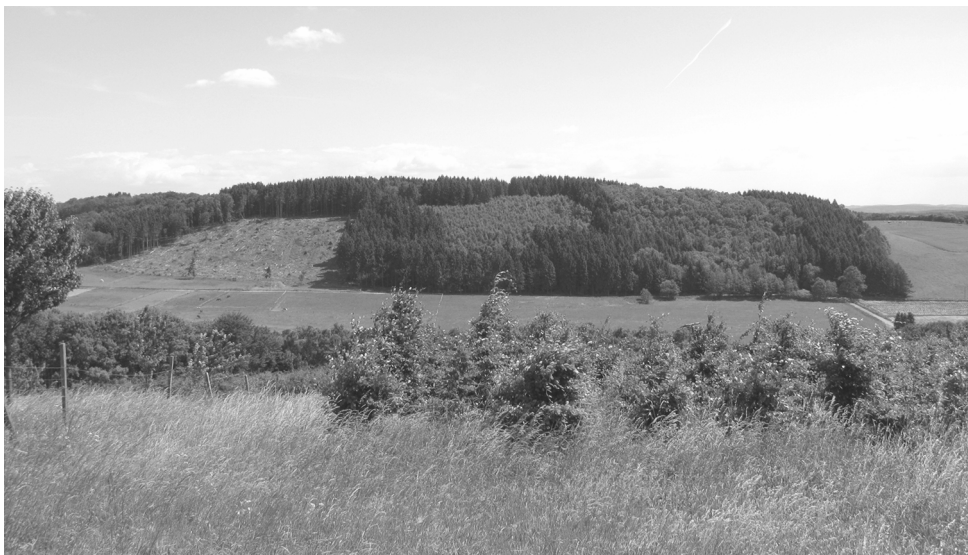
Figure 1: Modern clear cutting in the Sauerland (Germany). A felled patch is seen on the left side of the slope, in the middle older clear cutting is recognizable and on the right the woodland is nearly fully regenerated after clear cutting longer ago.

could also be punishment after an enemy was conquered (Nenninger 2001: 111ff.), but the reverse could also happen. After the Romans had defeated Phillip V of Macedonia in 198 B.C., he was forced to replant the forests ( silvae ) and sacred groves ( luci ) he had cleared during his war efforts (Livius 32.34.10). Although these textual sources seem to indicate clear felling, the question remains whether this is evidence for the application of a silvicultural system or just systematic destruction.