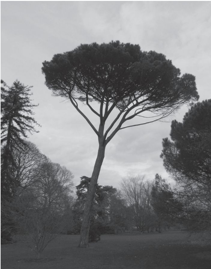
Figure 1: Stone pine growing at Kew Gardens, UK

The widespread recognition of stone pine cones in ritual activity (Kislev 1988) makes them a suitable case study for assessing the relevance of depositional criteria. Pinus pinea L. – the stone or umbrella pine, is an evergreen tree (Fig. 1). Stone pine is considered to have survived the glacial period in the western Mediterranean, before spreading east across the Mediterranean from around 1000 B.C. (Vendramin et al. 2008). The tree grows well in coastal areas, and on the low slopes of hills and mountains (Lim 2012). They are currently distributed from Atlantic Portugal to Lebanon and Turkey (Mutke et al. 2012). Pine cones are gathered from wild forests from October to the end of March. They are then left to ripen in the sun, before being beaten to extract the nuts (Harrison 1951; Mutke et al. 2012), which have been used as food source since the Palaeolithic (Humphrey et al. 2014).