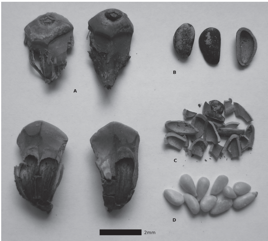
Figure 2: Parts of stone pine cones found in archaeobotanical samples. A = bracts, B = pine nuts, C = fragmented nutshells, D = kernels

The parts of stone pine cones are one of the most commonly recognised plant remains from ritual deposits in north-western Europe and Britain during the Roman period, alongside date ( Phoenix dactylifera L.) (Bakels and Jacomet 2003; Van der Veen et al. 2008). The cone consists of a number of bracts, each holding two nuts containing single kernels (Fig. 2). Each cone can