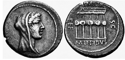
Figure 1: Coin of M. Aemilius Lepidus (RRC 419/3) showing the Basilica Aemilia decorated with shields (Classical Numismatic Group Inc., Electronic Numismatic Auction 321, lot 471, www.cngcoins.com )

considered this question for the Forum Romanum, and argues that although the Forum was not segregated space, its architecture was marked in such a way that women would have been made uncomfortable, and probably left of their own accord: voluntarily self-segregated (Boatwright 2011). I suspect that many women did indeed spend time in, or pass through, the Forum, but their presence was simply ignored by our sources. Yet their experience of the Forum would have been different from that of a man. What is more, it would have been different from their experience of domestic space, and we can even track possible variation in how women would have experienced different public spaces.