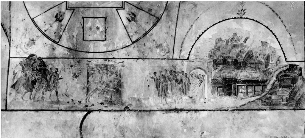
Figure 4: The Hypogeum of the Aurelii, Rome (Bandinelli 1922: pl. 10b).

key elements of the imperial and late antique adventus scene: emperor style figure, welcoming crowd, and city boundary.