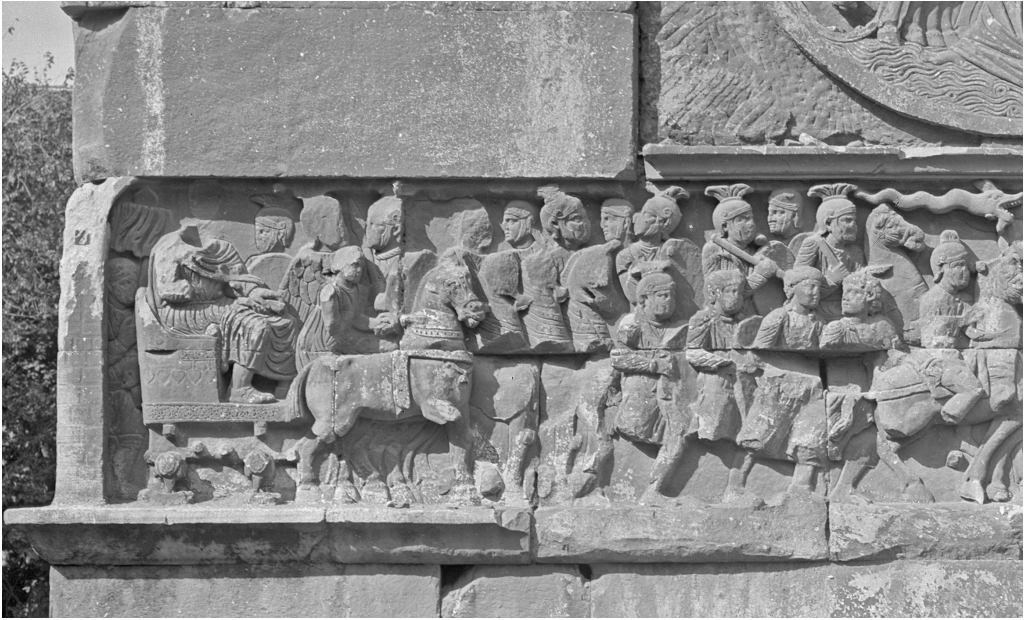
Figure 3: The Arch of Constantine, Rome (photo courtesy of the DAI Rome photograph archive).