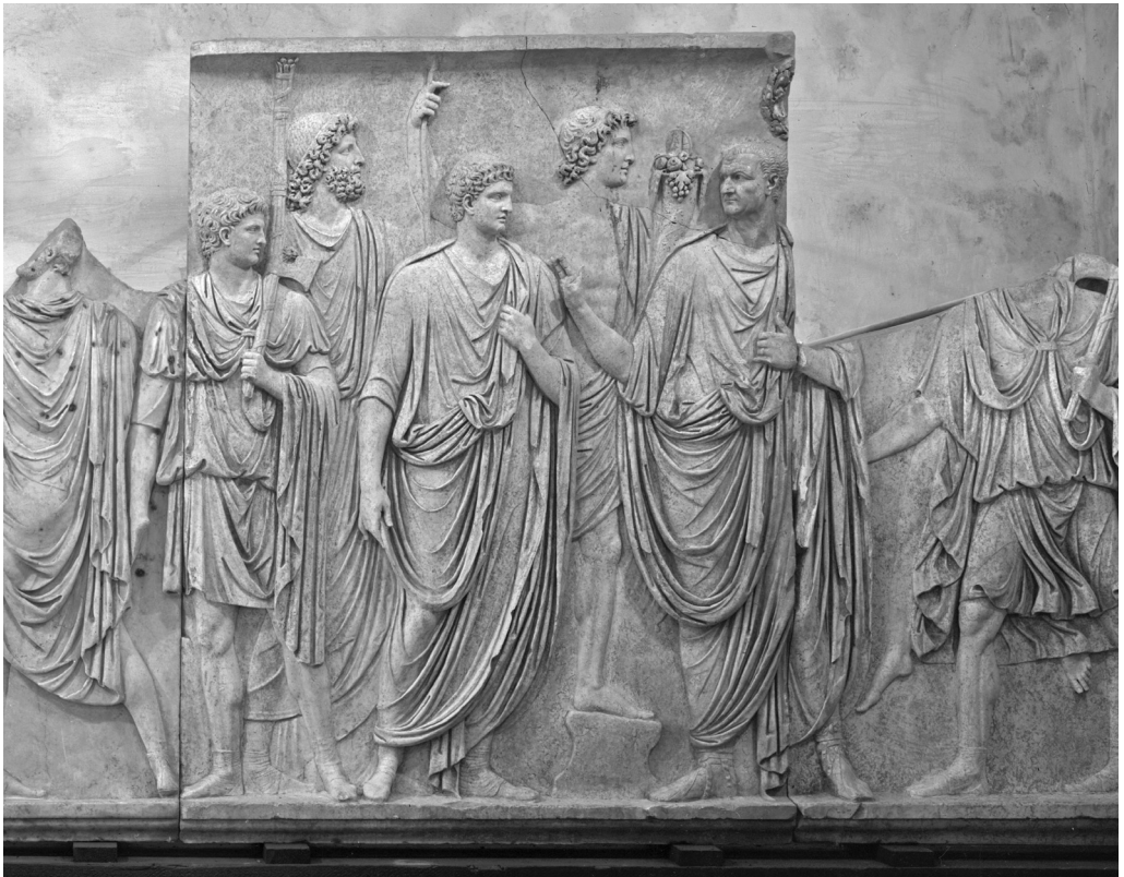
Figure 1: Cancellaria Relief B, Museo Gregoriano Profano.