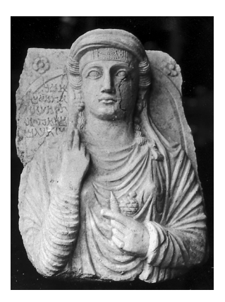
Figure 14: Akme daughter of Taimamed, The Archaeological Museum of Palmyra (after Sadurska and Bounni 1994: cat. 157, fig. 148).