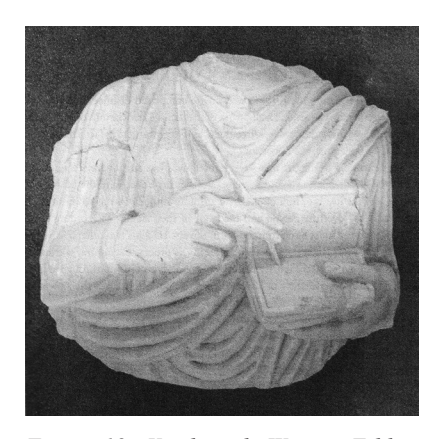
Figure 18: Youth with Writing Tablets and Stylus, The Archaeological Museum of Palmyra (after Smith 2013, fig. 33; Sokołowski 2014, fig. 27).

world. Regretfully, those codes and communications can only be reconstructed in a simplified way. Sometimes it is virtually impossible to recover them convincingly, just like in case of the issue of female participation in activities of everyday writing in Roman Syria.