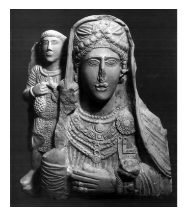
Figure 16: Unknown Woman with child and key with Greek Inscription, The Archaeological Museum of Palmyra (after Tanabe 1986: Pl. 359; Sokołowski 2014; fig. 15).