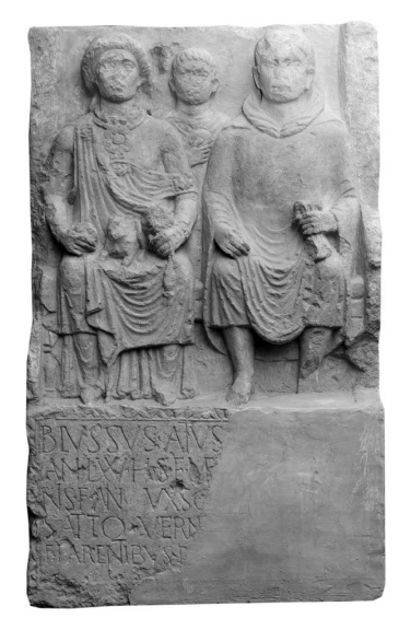
Figure 2: The Stele of Blusus and Menimane, Mainz, Landesmuseum (after Selzer 1988: 165, No. 110).

What is of pivotal importance is that geographically embedded portrait commissions were definitely not treated by their producers or purchasers as works of art (Stewart 2008: 18–21; Hallett 2015; Squire 2015). Quite to the contrary, it appears that their value was profoundly utilitarian. The sculptural monuments produced in the Graeco–Roman world had been meant to fit the communicative context they were placed in. In the case of funerary portraiture, its ultimate purpose was to fully reproduce the