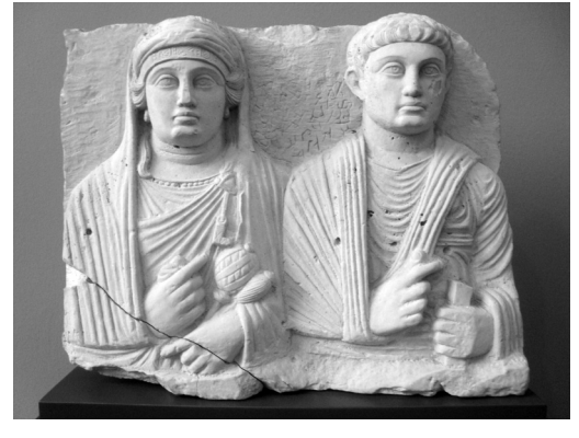
Figure 5: The Unknown Couple from Palmyra, Ny Carlsberg Glyptotek (after Ploug 1995: cat. 30: 105)

A quite similar example of a spindle and a distaff appears likewise as a female attribute of funerary relief preserved at Epiphaneia at a tomb that dates back to the reign of Trajan (Fig. 6). The reliefs of women dressed in local attire displaying the same attributes, alone or together with their husbands, were commissioned in Zeugma from the Hadrianic period through all Antonine until the Severan