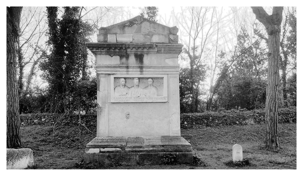
Figure 1: The Tomb of Rabirii on Via Appia.

2014: 139–140). Most of these territories were populated by a regional substratum of 'native' (non–Roman/Italic) origin – a group that defies a clear definition due to the lack of literary sources, but is evidently tangible in material culture record, as shown in collective work edited by Andreas Schmidt–Collinet (2004). The observations on Roman portraiture signify the fact that the Roman Empire was a formation of extraordinary geographical extent with a number of populations encompassed within its borders. Consequently, Roman art was always eclectic and characterized by varying styles attributable to different regional tastes and diverse preferences (Kleiner 1992: 10).