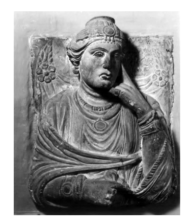
Figure 12: Palmyrene Woman with Antonine hairstyle, The Archaeological Museum at Damascus (after Tanabe 1986: Pl. 351).