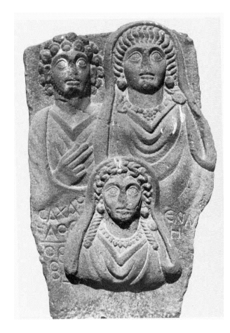
Figure 9: Schamalos, Obbe and Ebbe, The Archaeological Museum of Damascus (after Parlasca 1982: Taf. 21,1; Sartre– Fauriat 2001: No. 16, fig. 346).

Naturally, the fact that information of local origin was added to the visual and epigraphic message of Palmyrene funerary portraiture does not imply that there was no transfer of messages from Italy and other provinces of the vast Roman Empire. In fact, even the commissions that evidently reflected the local iconographic variants were produced in certain periods defined by political changes taking place in the Roman Empire, like the integration of the East under Trajan, or the