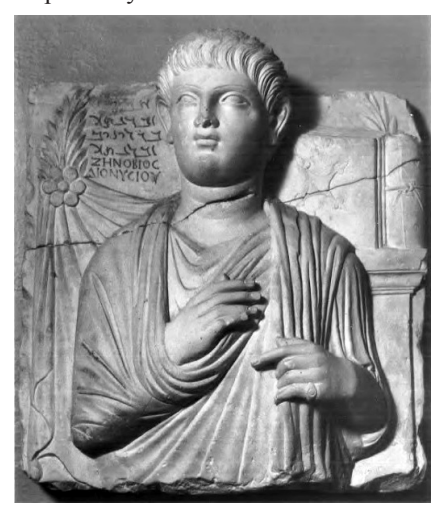
Figure 17: Zenobios–Zabdateh, The Archaeological Museum of Palmyra (after Tanabe 1986: Pl. 290; Sadurska and Bounni 1994: fig. 91; Sokołowski 2014: fig. 2).

The number of iconographic variations of writing tools combined with information provided by Greek and Palmyrene scripts is indeed impressive in the case of Palmyra. They seem to have been addressing several codes that were locally recognized. These codes were undeniably partly independent from the outside and partly connected with communications from the outer