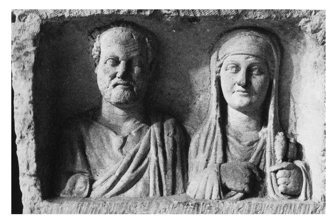
Figure 7: Unknown Couple from Zeugma, Gaziantep Museum (after Wagner 1976: Taf. 49, Nr. 122).

era (Fig. 7) (see: Wagner 1976: Taf. 34, Nr. 42b, Taf. 49, Nr. 122–124; Parlasca 1982: Taf. 7,4, Taf. 12,1; Balty 2004: fig. 11). Moreover the funerary portrait reliefs from Zeugma and Epiphaneia, as well as Palmyra, reveal similar iconographic and stylistic traits at the same time. Interestingly, in the late second and third centuries the spindle and the distaff became the female attributes depicted on funerary monuments in Phrygia (Lochman 2003: II 207, II 220, II 221, II 225, II 226). The men were portrayed in civilian, Graeco–Roman dress, just like in Syria, and the writing attributes hold in hand (Lochman 2003: II 192) or depicted on the steles as a male attribute together with wool baskets symbolizing womanhood (Lochman 2003: II 39, II 110). Additionally, one stele with a boy holding a bird is attested (Lochman 2003: II 219); a popular child attribute in Palmyrene portraiture as well (Colledge 1976: 158). Those observations can support the suggestion of cultural interactions, made by Parlasca in