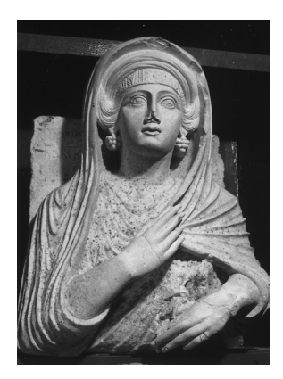
Figure 15: Aqmat, The Archaeological Museum of Palmyra (after Sadurska and Bounni 1994: cat. 207, fig. 176).