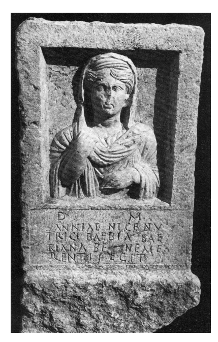
Figure. 4: The Tombstone of Annia Nice, The Archaeological Museum of Palmyra. (after Parlasca 1982: Taf.23,4).

The use of more than one alphabet in the single funerary context just presented above reveals the exceptionally rich reception of communicative