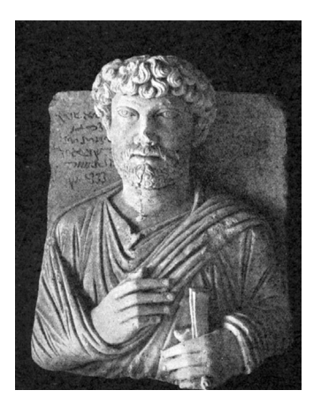
Figure 10: Ateaquab son of Jedibel, The Archaeological Museum of Istanbul (after Ingholt 1928: PS11).

travels of Hadrian. Two funerary reliefs that portray a man and a woman, respectively, can provide the example of the communicative impact from Rome. The funerary relief of Ateaquab, son of Jedibel (Fig. 10), now on display in Istanbul Museum, shows a bearded man with a cap of rich, messy, wavy locks falling from the crown of the head onto the forehead and ears. The inscription in Palmyrene script informs that Ateaquab passed away on March 13, 468, according to Seleucid Era, which is equivalent to A.D. 157. The portrait of a certain woman, now on display in Damascus Museum (Fig. 12), shows her with a particular hair ar-