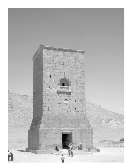
Figure 3: The Tower Tomb of Elahbel in Palmyra. (D. Wielgosz-Rondolino 2016).

private, almost secret context reveals the names of the 'westernized' Lucius Eras son of Zabu and his employees who, on the contrary, were bearing only the local, Aramaic names. Multilingual inscriptions also appear in private funerary contexts of Palmyrene tombs and relief sculptures that adorn their walls.