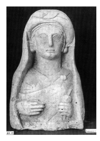
Figure 6: Unknown Woman from the Tomb in Epiphaneia, Hama (after Parlasca 2006: Taf. 23b).