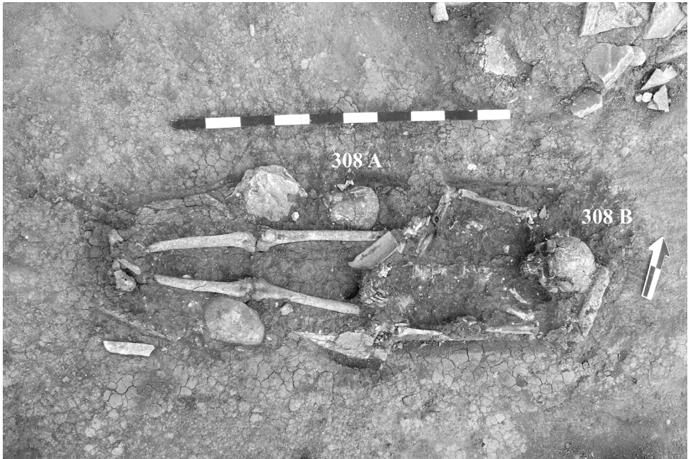
Figure 2: Burial 308 at Vagnari, showing individual B in an extended position, with the cranium of individual A to the north of B's right femur.