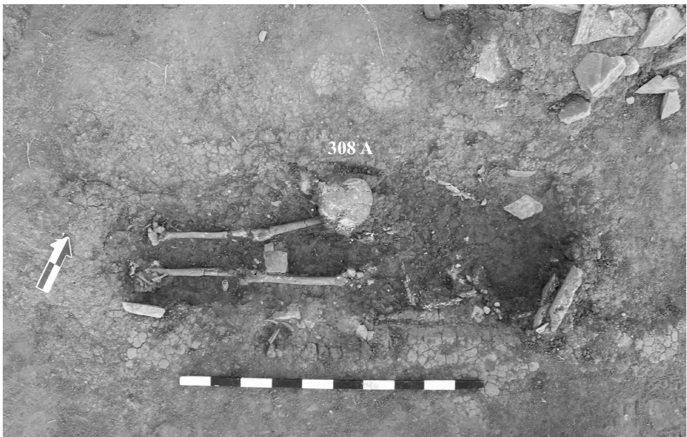
Figure 3: Burial 308 at Vagnari, showing individual A, with the cranium on top of the right femur.