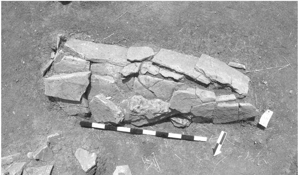
Figure 1: Burial 308 at Vagnari, showing a cappuccina burial with rocks reinforcing the grave cover on the north side.

Once the tile cover was removed, a cranium was identified at the centre of the grave on the northern side (individual A), beneath an extended, primary burial (individual B) (Fig. 2). After the skeleton of individual B was removed, there was a layer of soil approximately 10 cm thick between individuals. The lower limbs of individual A were fairly well preserved, but only faint traces remained of the pelvis, thorax, and right radius and ulna (Fig. 3). The cranium of individual A was found resting on the proximal end of the right femur, while parts of the mandible and some mandibular teeth were found to the north of the right humerus, which was rotated, its anterior surface was facing down (or inferiorly), rather than in proper anatomical position like the left humerus. Fragments of tegulae were found at the edges of the burial once both skeletons were removed. They likely formed part of the earlier grave cover, which was disturbed and partially removed. It is apparent that Burial 308 at Vagnari was used consecutively for two individuals. In the past, there would have been no further explanatory framework for this ‘disturbed’ burial, yet the order of events and time between depositions are vital aspects of the post-burial history of this grave.