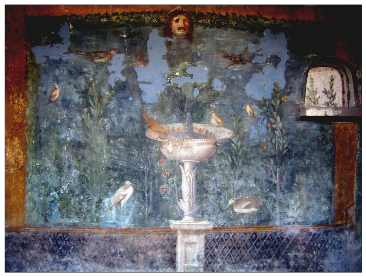
Figure 1: Garden fresco from the House of Venus in the Shell, Pompeii.

landscape, it would stand out from the predictable masonry and marble of other tombs. Whilst there may be some truth in this statement—maintenance of thoroughfares in and out of towns such as Pompeii probably meant that vegetation was prevented from encroaching too much on roads and city walls—it should be acknowledged that tomb gardens might also have blended in with the ecological elements of the suburban environment as much as they stood out from it, effectively blurring its boundaries.