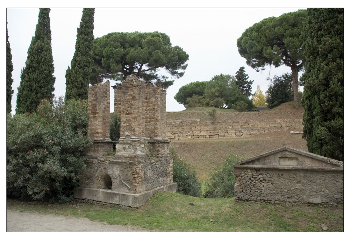
Figure 4: Tetrapylon tomb and adjacent tomb of Lucius Publicius Syneros, Aebia Fausta, Lucius Aebius Aristo and Aebia Hilara, Porta Nocera necropolis (Pompeii) in October 2009 (Photo: Paul Assman and Jill Lenoble. Reproduced under CC BY 2.0 License).

grew wild in the region of Vesuvius. The oleander, for example, still grows in the Campanian countryside (as well as between the ruined tombs of the Porta Ercolano and Porta Nocera: Figure 3 ), and is the plant most commonly depicted beyond the low garden fence in ancient frescoes, suggesting that as well as being an element of the garden it was also a common feature in the wild (Jashemski 1979: 54, 82). Indeed, in her detailed study of the fresco evidence, Jashemski (2001: 82) noted that 'although pattern books were available, we had the impression that the artist was painting flowers and fruit that were familiar to him ... the plants pictured were those growing in the area at the time of the eruption.'