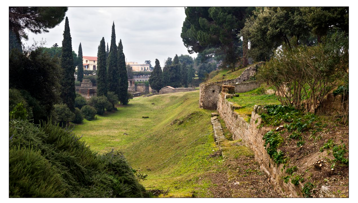
Figure 2: Area behind the Tetrapylon tomb, Porta Nocera necropolis (Pompeii) in February 2012 (Photo: Darren Puttock. Reproduced under CC-BY-NC-ND 2.0 License).