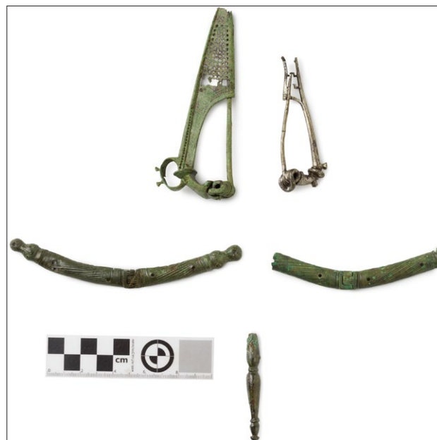
Figure 3: Different types of Norican-Pannonian brooches from Emona (top, from left to right): bronze Norican-Pannonian wing brooch and silver Norican-Pannonian wing brooch; bronze belt mounts: part of a Norican-Pannonian belt set from Emona (centre and bottom).

indistinct in the contemporary archaeological record, is clearly recognisable on tombstones where a man in a toga sits next to a woman wearing a 'Norican-Pannonian' costume (Šašel Kos 1997: 412–413). The toga—a traditional Roman piece of clothing—is often considered an important marker of male status, civil rights, and position in Roman society; it essentially functions as a national costume and a symbol of romanitas (Larsson Lovén 2014: 430–434). Moreover, it is clearly an item relating to males only and, in particular, an item of clothing worn only by elite males. However, there are instances in which this is negated, e.g. infames , such as prostitutes, wearing a toga (Ackerman 2016: 11). As such, the 'Norican-Pannonian' style of dress should not just be seen as an expression of the conservatism of female members of the provincial elite, it also might