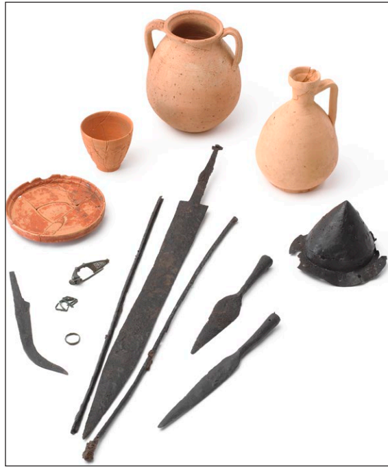
Figure 4: The grave goods from Cremation grave context no. 1042 from Kongresni trg, Ljubljana.