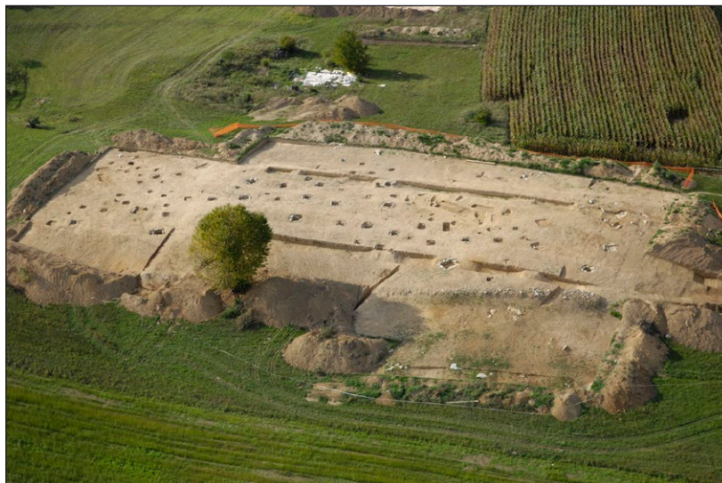
Figure 6: The Early Iron Age barrow and Roman period cemetery at Mačkovec under excavation in 2007. (Photo: Marko Pršina. Reproduced with the permission of the Institute for the Protection of Cultural Heritage of Slovenia, Centre for Preventive Archaeology).

Thus, it may be suggested that association with increasingly politically defunct Late Iron Age elite centres was supplanted by smaller scale identification with specific local areas in the landscape, probably as a means of exerting or emphasising direct control over the land, even at the expense of sacrificing part of it to mortuary space in the process. It is possible that the burial populations of these new cemeteries are drawn from groups that exercised control over these areas in the Late Iron Age, but were previously buried at the regional centres. It is also likely that the traditional elites were increasingly drawn to the civitas centre as an arena for expressing and maintaining status, or were supplanted by new elites of native and/or non-native origin based on association with the Roman state, some of which employed the ‘Norican-Pannonian’ barrow