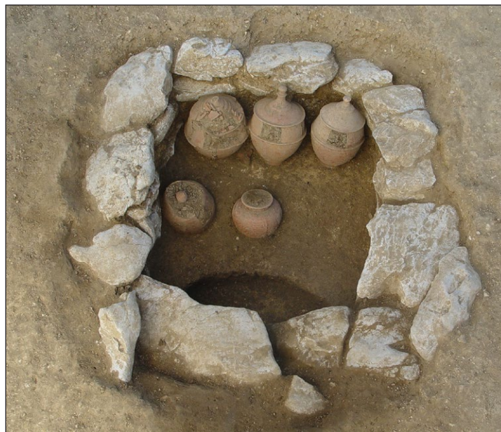
Figure 5: Cremation grave context no. 1012 from Mačkovec near Novo mesto. The grave contains a total of four 'House' urns. (Photo: Aleš Tiran. Reproduced with the permission of the Institute for the Protection of Cultural Heritage of Slovenia, Centre for Preventive Archaeology).

A. 1976: 191–223; Udovč in press). House urns have also been found in Roman period rural flat cemeteries that have no known associated settlements, including the cemetery with a Late Iron Age founder's grave at Verdun, near Stopiče in the foothills of the Gorjanci hills (Breščak 1990b: 99–102).