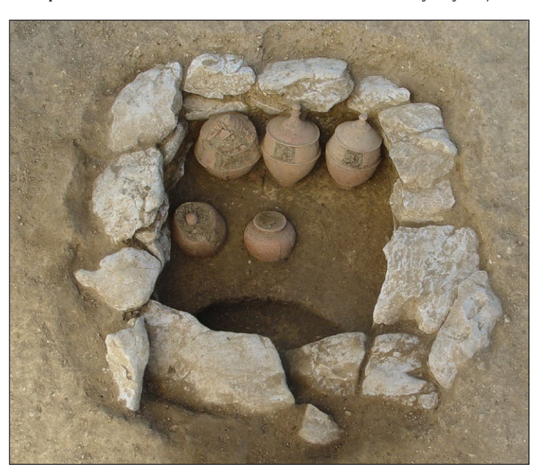
Figure 5: Cremation grave context no. 1012 from Mačkovec near Novo mesto. The grave contains a total of four 'House' urns..

A. 1976: 191–223; Udovč in press). House urns have also been found in Roman period rural flat cemeteries that have no known associated settlements, including the cemetery with a Late Iron Age founder's grave at Verdun, near Stopiče in the foothills of the Gorjanci hills (Breščak 1990b: 99–102).