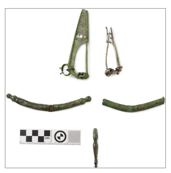
Figure 3: Different types of Norican-Pannonian brooches from Emona (top, from left to right): bronze Norican-Pannonian wing brooch and silver Norican-Pannonian wing brooch; bronze belt mounts: part of a Norican-Pannonian belt set from Emona (centre and bottom) (Photo: Andrej Peunik. Reproduced with of the Museums and Galeries of Ljubljana).

indistinct in the contemporary archaeological record, is clearly recognisable on tombstones where a man in a toga sits next to a woman wearing a 'Norican-Pannonian' costume (Šašel Kos 1997: 412–413). The toga—a traditional Roman piece of clothing—is often considered an important marker of male status, civil rights, and position in Roman society; it essentially functions as a national costume and a symbol of romanitas (Larsson Lovén 2014: 430–434). Moreover, it is clearly an item relating to males only and, in particular, an item of clothing worn only by elite males. However, there are instances in which this is negated, e.g. infames , such as prostitutes, wearing a toga (Ackerman 2016: 11). As such, the 'Norican-Pannonian' style of dress should not just be seen as an expression of the conservatism of female members of the provincial elite, it also might