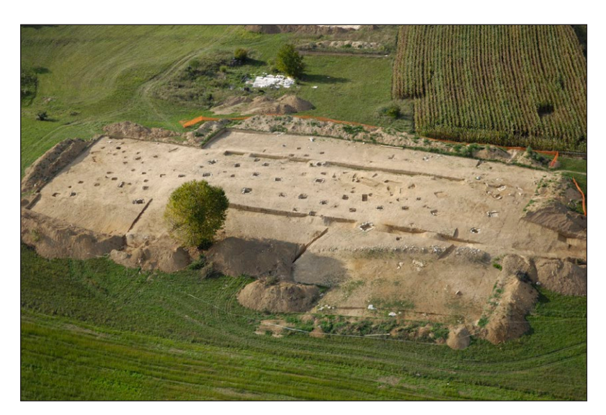
Figure 6: The Early Iron Age barrow and Roman period cemetery at Mačkovec under excavation in 2007.

Thus, it may be suggested that association with increasingly politically defunct Late Iron Age elite centres was supplanted by smaller scale identification with specific local areas in the landscape, probably as a means of exerting or emphasising direct control over the land, even at the expense of sacrificing part of it to mortuary space in the process. It is possible that the burial populations of these new cemeteries are drawn from groups that exercised control over these areas in the Late Iron Age, but were previously buried at the regional centres. It is also likely that the traditional elites were increasingly drawn to the civitas centre as an arena for expressing and maintaining status, or were supplanted by new elites of native and/or non-native origin based on association with the Roman state, some of which employed the 'Norican-Pannonian' barrow