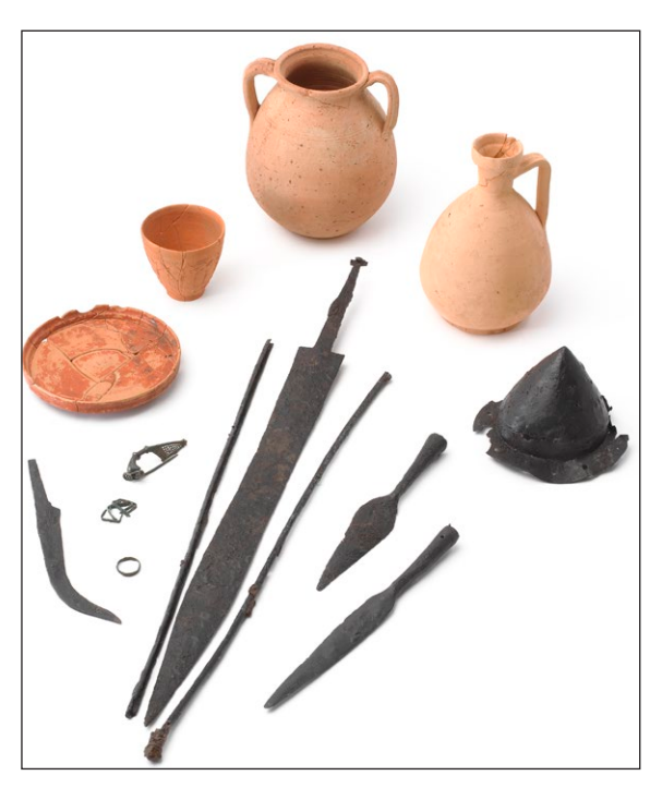
Figure 4: The grave goods from Cremation grave context no. 1042 from Kongresni trg, Ljubljana. (Photo: Matevž Paternoster. Reproduced with of the Museums and Galeries of Ljubljana).