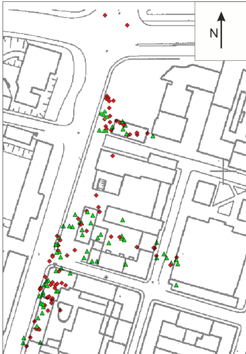
Figure 3: Male (green triangle) and female (red diamond) burials at Emona's northern cemetery (burials from Potniški center are omitted due to incomplete spatial data).