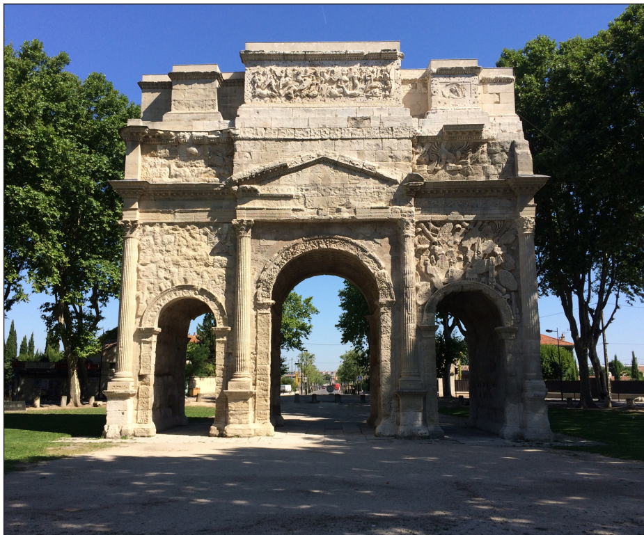
Figure 2: Orange, Arch (Author's photo 2015).

The monument presents a complex visual program composed of reliefs that depict spoils, trophies, scenes of battle, captives, and allegorical figures. These panels employ the technique of incised contours with a great degree of variation. For example, it appears in the frieze, running around the four sides of the arch, to outline the pairs of Roman and barbarian fighters engaged in single combat ( Figure 3 ). It also features prominently in the reliefs that occupy the spaces above the lateral arches, depicting heaps of spoliated weapons and armor. In those, the technique was used to add decorative details and to label some of the objects represented, such as the names of Gallic chieftains inscribed on the shields. Elsewhere on the monument, especially on the reliefs that display naval spoils on the first attic, the technique is used much more