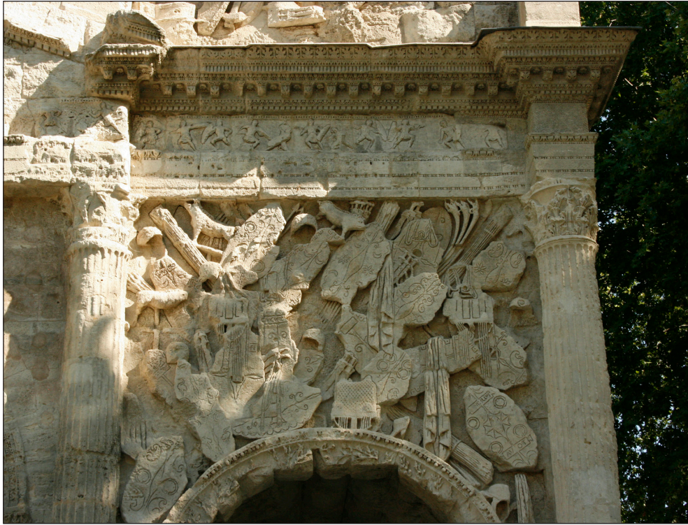
Figure 3: Orange, Arch. Detail of weapons relief and frieze.

aggressively to outline a great number of the artifacts shown, including ship prows, anchors, and tridents. 8 In these panels, the artists took advantage of the combination of three-dimensional modeling and line contouring to maximize the amount of information shown, a strategy that possibly saved time and effort. In the battle scenes that decorate the central section of both sides of the attic, the contours were also used in combination with three-dimensional sculpting to show the mélange of Roman and barbarian soldiers taking part in a fierce battle. The style of these reliefs evokes Hellenistic precedents, such as battle-themed sarcophagi and paintings. 9 The combination of a Hellenistic style to depict a Roman subject matter, and executed in what is presumably a local technique, exemplifies the polysemic and multicultural character of the art of Gallia Narbonensis.