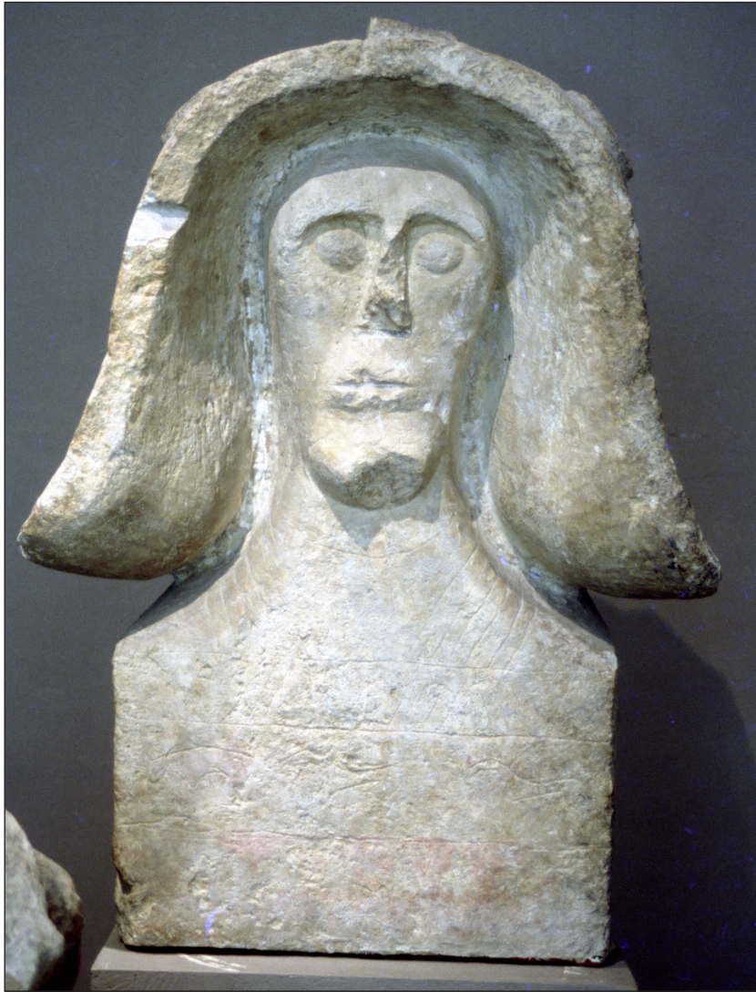
Figure 5: Warrior Bust from Sainte-Anastasia. Musée de la Romanité, Nîmes. (Photo by Tyler Bell licensed under CC BY 2.0 ).