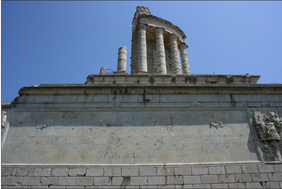
Figure 10: La Turbie, Model of Augustan Trophy (Author's photo 2015).