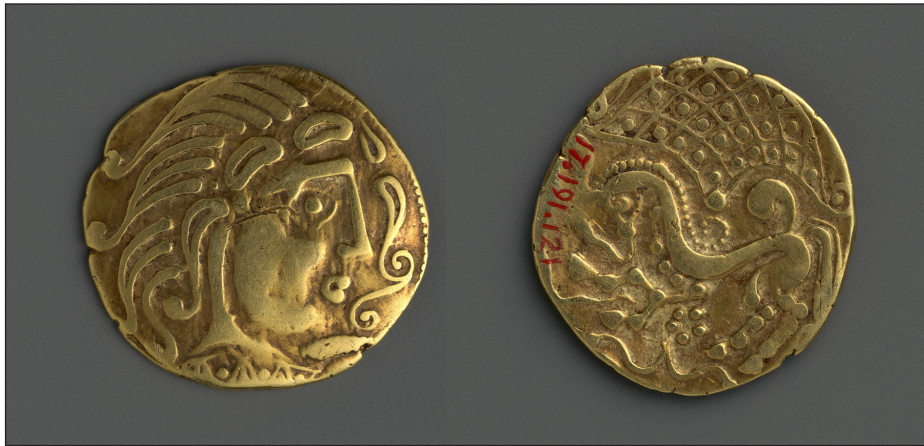
Figure 9: Gold stater of the Parisii. New York, Metropolitan Museum of Art ( 17.191.121).