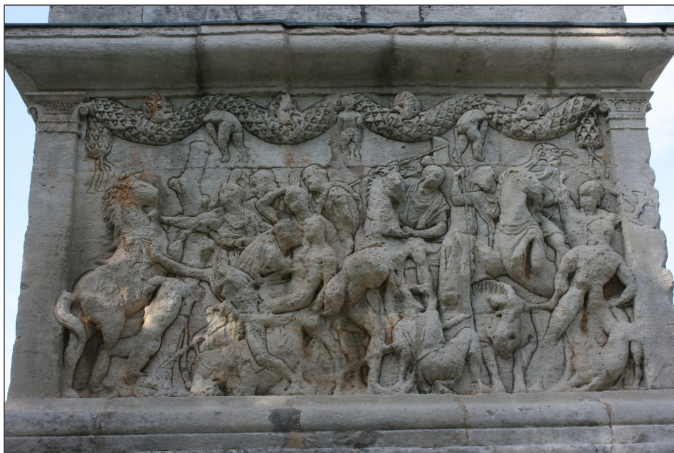
Figure 4: Glanum, Mausoleum. Detail of battle scene.

Further examples that employ incised contours to highlight details in three-dimensional sculpture include the numerous seated warriors that have been found throughout Provence at sites such as Glanum and Roquepertuse (Pobé and Roubier 1962: cats. 35, 36; Barbet 1991; Boissinot 2011; Py 2011: 85–90, 103–118; Kruta 2015: 78). Two of them, also from the sanctuary at Roquepertuse represent headless male figures sitting in a rigid, vertical posture with hands resting on the knees ( Figure 7 ). 12 The figures sit on stone pedestals measuring 50 centimeters in height. Their bodies are rendered in a geometric fashion, although there