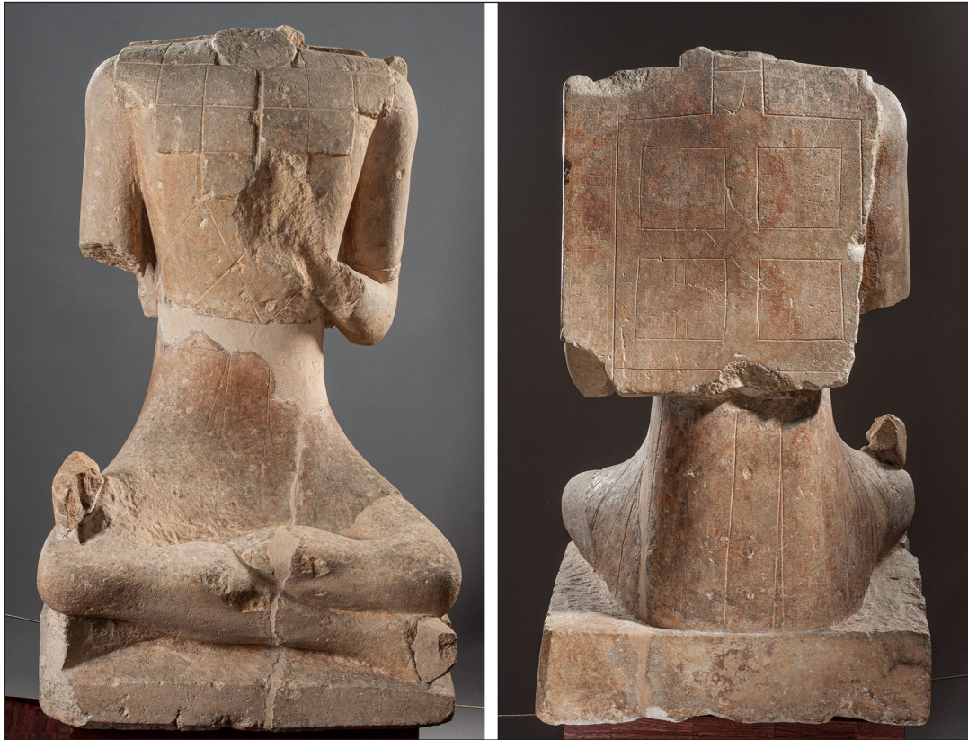
Figure 7: Seated Warrior from Roquepertuse sanctuary. Musée d'Archéologie Méditerranée, Marseille (Photos by © Damelet Groscaux, Aix Marseille Univ, CNRS, CCJ, Aix-en-Provence, France. Reproduced with permission).

is an attempt at portraying anatomical details and musculature. Although now severely faded, the figures exhibit elaborate costumes consisting of a breastplate and a square shield that hangs at their backs. The costumes were drawn in the stone with incised lines that compose geometric patterns, brightly painted in red and black. The meaning of these figures remains elusive, but their context suggests the funerary effigy of a pair of warriors or ancestors. 13 Once again, incised lines were combined with three-dimensional modeling, signaling a distinct regional style.