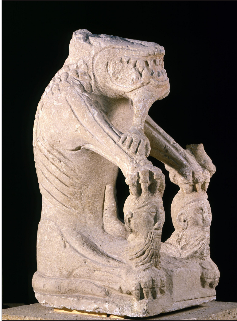
Figure 8: La Tarasque de Noves . Avignon, Musée Lapidaire (Artwork purchased in 1849 by Fondation Calvet. Photo by © Fondation Calvet. Reproduced with permission).