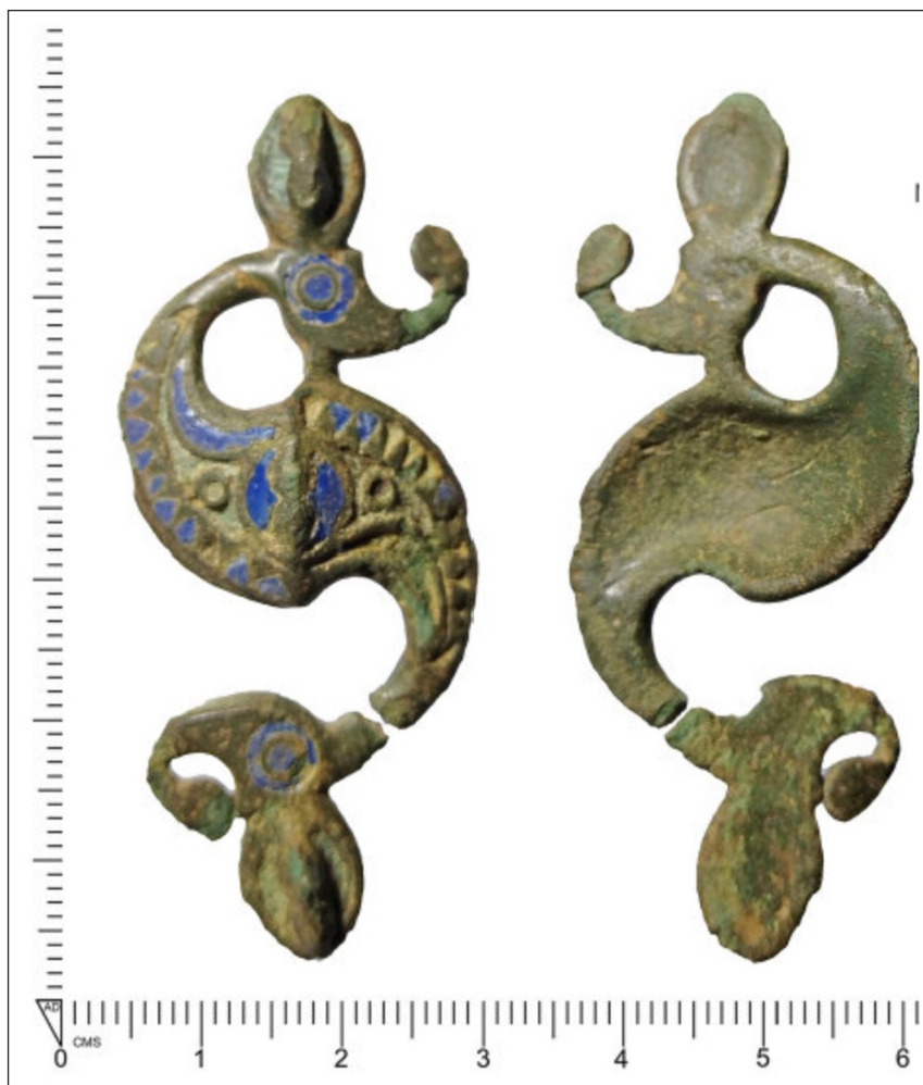
Figure 4: Dragonesque brooch found in Yorkshire (Image courtesy of the Portable Antiquities Scheme, Record ID: SWYOR-4BDA8D).

the type we see emerge during the post-conquest period. This is due to the fact that their decorative flourishing emerged from the explosion of ‘new’ Celtic art (Hunter 2013: 273). Dragonesque brooches reflect the tastes and preferences of peoples who were actively participating in the bricolage of aspects of Roman technology but were conscientiously engaging with their perceived local ‘native’ identities in terms of artistic expression. This was being demonstrated rather overtly through displaying altered provincial designs and aspects of adornment. Therefore, it seems accurate to surmise that the designs are by their nature provincial in concept.