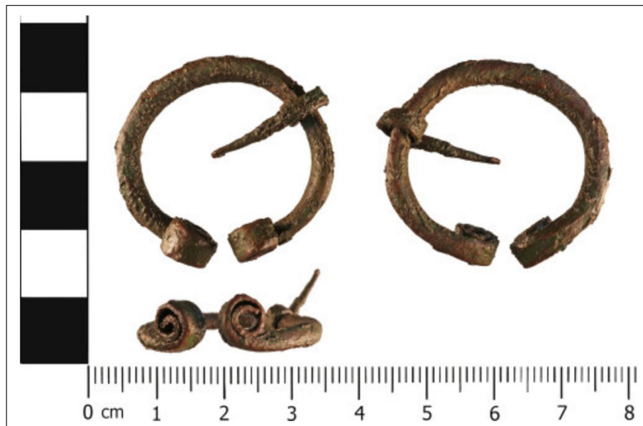
Figure 2: Copper alloys Penannular brooch found in Staffordshire (Image courtesy of the Portable Antiquities Scheme, Record ID: WMID-77D0BC).

appears to be more prolific in the use of the penannular type than the South (Cool and Baxter 2016: 87). This may be due to the simple design and the long use life of this brooch type. It has proven impossible to accurately provide start dates for some sub-sets of the penannular grouping without having the item's carbon dates due to the penannular's similarity to other brooch types. Furthermore, this brooch type had a seemingly bimodal use-live over many centuries, providing another issue for dating and our interpretation of distribution patterns (Cool and Baxter 2016: 74).