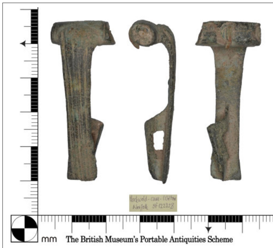
Figure 3: Bow brooch found in Norfolk (Image courtesy of the Portable Antiquities Scheme, Record ID: SF-122328).

to dominate, the later types having a utilitarian function commonly associated with the army (Brown 1986: 11–14). The argument that the early brooches suggest that the settlement was already well established and affluent by the first quarter of the first century AD, with a continued persistence of native styles and designs is flawed. Although these suppositions seem accurate, they do not account for the nature of the use lives of brooches. These brooches must therefore be dealt with tentatively as they could remain in use or be kept for another purpose for more than one generation before being discarded or lost. It has been theorised that this typology had such long use-lives due to their signifying authority and so the bow brooches which were worn and/or repaired could take on lives of their own, being themselves a signifier of power and control to the local audiences (Cool 2010: 41). When the abundant existence of a LPRIA brooch type, however, is correlated with our knowledge of Norfolk and its importance in the development of Brittonic metal working, we can suppose that cultural appropriation had little influence on the development of Bow brooches in Norfolk. This is demonstrated through design trends and the persistence of local brooch types.