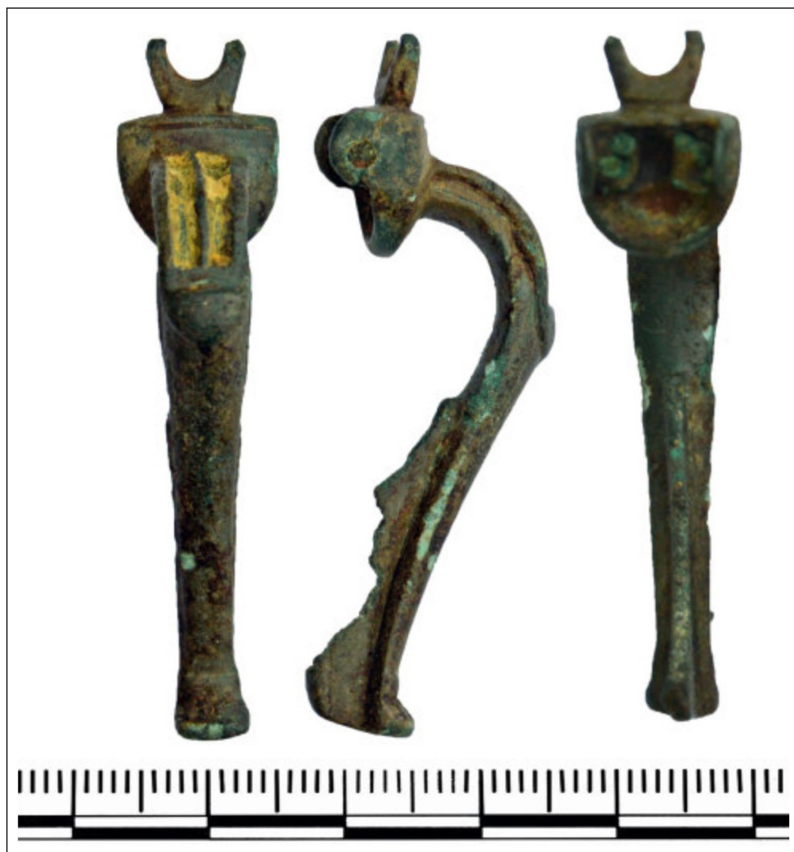
Figure 5: Copper alloy Wirral type brooch (Image of curtesy of the Portable Antiquities Scheme, Record ID: GLO-1DD6C2).

An apparent popular brooch type in the north and north-west of Roman Britain during the second century is the 'Wirral' type, characterised by a bow of semi-oval section, usually decorated with a rectangular panel which contains three long strips with an enamel infill (Figure 5). Below the enamel panel, at the waist, there is typically a boss or stud which is on some occasions decorated with a star most commonly with four or five points, done with enamel. The head has a loop and a head-plate, which is cast in one with the bow and catchplate. In most cases, the head-plate takes the form of a series of steps frequently bearing knurled decoration or less often an enamelled panel (Philpott