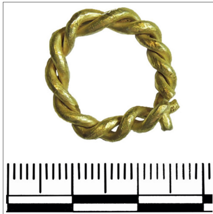
Figure 1: Two strands of circular cross-section wire that have been twisted together, suspected section of golden Iron Age Torc found in Gloucestershire (Image courtesy of the Portable Antiquities Scheme, Record ID: GLO-ADCB3A).

One of the most recognisable LPRIA items of adornment associated with Brittonic regions and peoples is the neck torc ( Figure 1 ). The torc as an item of adornment might provide an example of a LPRIA pre-existing tradition of importing (or exporting)