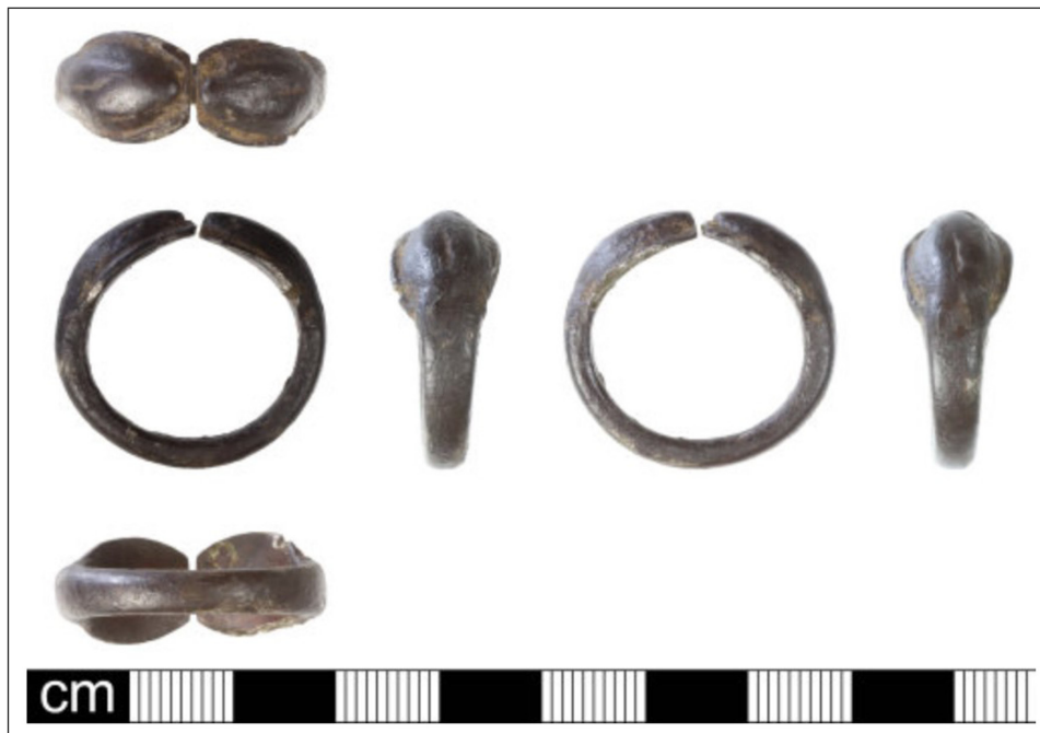
Figure 8: Snake ring (Image courtesy of the Portable Antiquities Scheme, Record ID: NMS-1FFD6E).

One of the largest assemblages of Romano-British rings found in one context dating before the second century AD is the Snettisham Roman jewellers hoard in Norfolk (Figure 8). Pike and Cowell (1997) grouped the snake rings of this hoard into three well-defined types. The first category is that of the overlapped wound-wire rings, the second consists of plain rings set with stones (some clearly unfinished), and the third include faceted rings (Pike and Cowell 1997: 50), with the only variation in the physical construction of each type being size. The general uniformity would suggest that there was a manufacturing repertoire among the owner(s) of the hoard. However, it is possible that the hoard represents a brief snapshot of the last batch of rings produced before their deposition after the workshop's closure, rather than a reflection of the full range of outputs. Interestingly, when compared to an early Romano-British ring we see very little variation in the chemical compositions of the silver used despite their deposition at separate sites. This suggests that the development of this finger ring in Britain centred around the adoption of the jewellery type and the subsequent categories of ring. Production and the sourcing of raw materials remained local to Britain. The ring used as a comparative object to those found in the Snettisham hoard is the complex snake-ring from Slay Hill, Saltings, Kent, (Pike and Cowell 1997: 50) referenced as Cat/Reg No. 276 in Table 2.