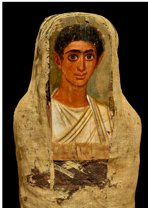
Figure 1: Fayum portrait of a young man from Thebes, c. AD 140–180.

‘The people buried this way were neither ethnically half-Roman/half-Egyptian, nor were they looking for a Roman and/or Egyptian identity. They had themselves portrayed the way elites had themselves portrayed all around the Mediterranean ... and they were buried the Egyptian way. In the same period, an ethnic Syrian living in the Fayum could be buried like this’.