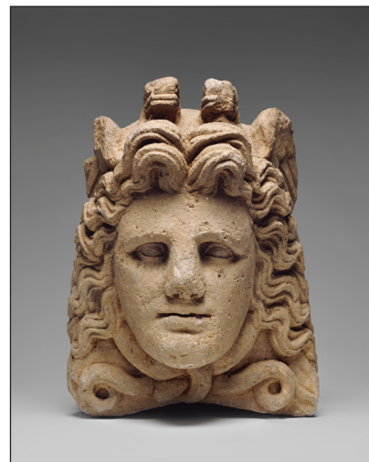
Figure 4: The Getty Etruscan Medusa, 300–275 BC (The Getty Museum, 78.AA.10. Public Domain).

Medusa masks were common on Etruscan and Roman urns, funerary gambles, tombstones, and tombs (Almasri et al. 2018: 93). Medusa’s presence in Roman funerary urns may have roots in Hellenistic Etruscan urns, the most interesting example of which is the Getty Etruscan Medusa (Figure 4), dating to the late fourth or early third centuries BC (Del Chiaro 1981: 53). Del Chiaro (1981: 57) writes other Etruscan Medusas in the round are unknown to him, but ‘the Getty Etruscan Medusa head and the counterparts on later urns are ultimately derived from a Greek prototype dating to the Classical period and destined for a long-lived existence down into Roman times’. He considers the Getty Medusa’s closest relative to be a stucco Medusa found in the Tomb of the Volumnii, on the urn of Arnth Velimna. It also shares iconography with the ‘Medusa head within a coffer to the ceiling of the tablinum ’ which shares serpent heads and wings on top of its head and ‘bearded’ snake tails (Del Chiaro 1981: 53).