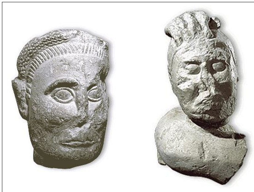
Figure 10: Pieces of a statue found at Entremont of a warrior cradling a collection of trophy heads. (Left) Head of warrior. (Right) One of six trophy heads (Adapted from: Ministère de la Culture. CC-BY-SA 3.0. https://archeologie.culture.gouv.fr/entremont/en/statues ).

(Armit 2012: 178). In examples from the Iron Age, such as at Entremont, the living, assumedly victorious warrior sculptures are depicted with lively, opened eyes with details of their lids. But, in the case of the cross-legged warrior from Entremont, the severed heads of his enemies laid out in his lap have the same ‘puffy’ eyes (Armit 2012: 177–178), ‘as if to reflect death, closure, absence of engagement and the negation of being’ (Aldhouse-Green 2004a: 191). Compare the eyes of the cross-legged warrior and his collection of severed heads (Armit 2012: 177; Figure 10 ), and the deathly eyes of the funerary Gorgon ( Figure 11 ) with the other possible Romano-British Gorgons ( Figures 8 and 9 ). As you can see, the eyes of Figures 8 and 9 and the warrior in Figure 10 are detailed, alive, whereas the severed heads of Figure 10 and the Gorgon in the funerary context ( Figure 11 ) denote death. This may be a sign of the visual language used in severed head traditions originating from the provinces combining with the shared contexts and iconography of the Classical Medusa to form a new visual language which contributes to the victorious Bath Gorgon and the deathly funerary Gorgon.