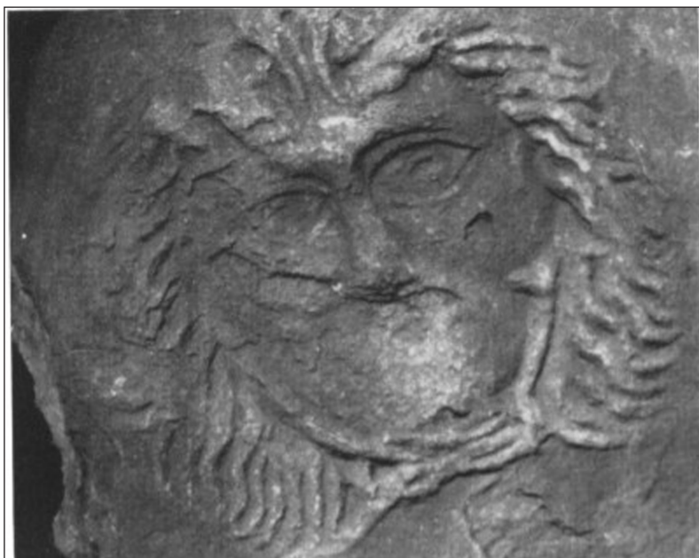
Figure 9: Close up of the Gorgon on the Castle Baths labrum (Richmond and Toynbee 1955, pl. XXXVI. Reproduced with permission).