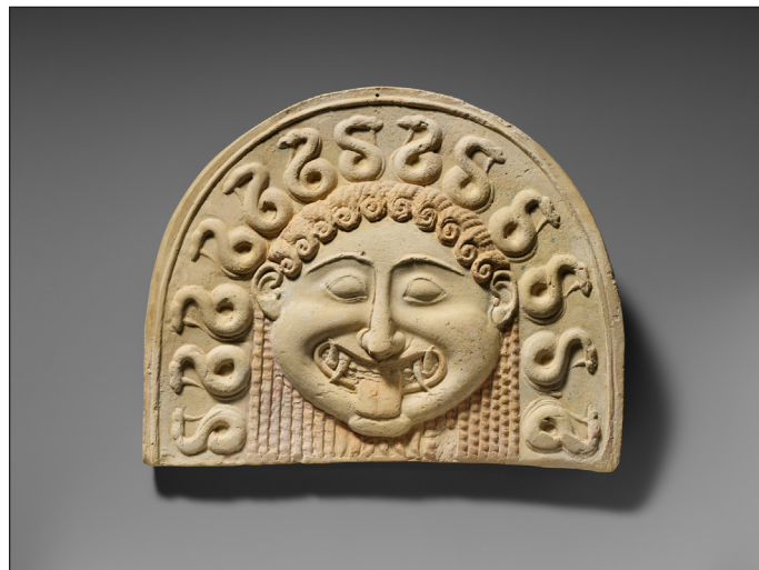
Figure 3: Greek Tarentine terracotta painted gorgoneion antefix (roof tile), c. 540 BC (The Met Museum, 39.11.9. Public Domain).

The Medusa of the Mediterranean world was itself an example of ‘Globalization’ in action. Spreading from Greek culture—where depictions date as early as the seventh century BC (Almasri et al. 2018: 90)—into Etruscan and Roman cultures before permeating wider into the Roman provinces, she was already a ‘globally’ recognisable figure but with local variation. The name ‘Medusa’ comes from the Greek verb μέδω which means ‘to guard or protect’, likely the reason why she was so prevalent in Classical funerary art (Almasri et al. 2018). As such, Medusa appeared on funerary objects in her origin culture of ancient Greece, a practice persisting into the Etruscan and Roman cultures (Almasri et al. 2018: 92–93). Following a Hellenistic tradition, the Roman Medusa was often portrayed as a beautiful woman (Almasri et al. 2018: 93), in contrast with Archaic Greek art in which she and other Gorgons had a monstrous appearance ( Figure 3 ).