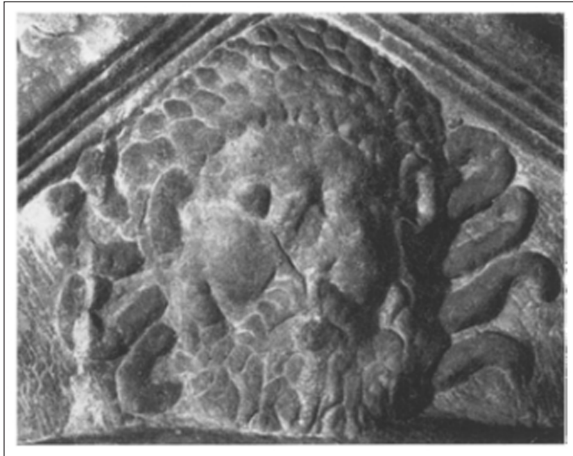
Figure 11: The Gorgon on a tombstone pediment at Chester (Richmond and Toynbee 1955, pl. XXXVI. Reproduced with permission).