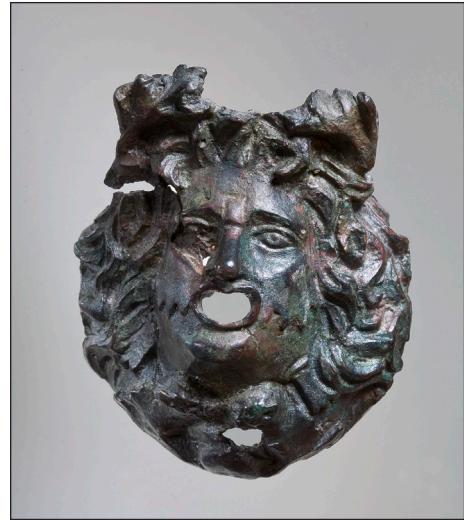
Figure 7: Bronze Oceanus mask waterspout (Thorvaldsens Museum, H2093. Public Domain).

If only it were known whether this piece came before or after the Gorgon on the temple pediment at Bath. Despite uncertainty regarding whether this is a male Gorgon, the York plaque may show that the radiating hair associated with the Bath example is not exclusively tied to Oceanus. Radiating hair may have different indigenous origins, or the artist may have taken inspiration from the Bath Gorgon.