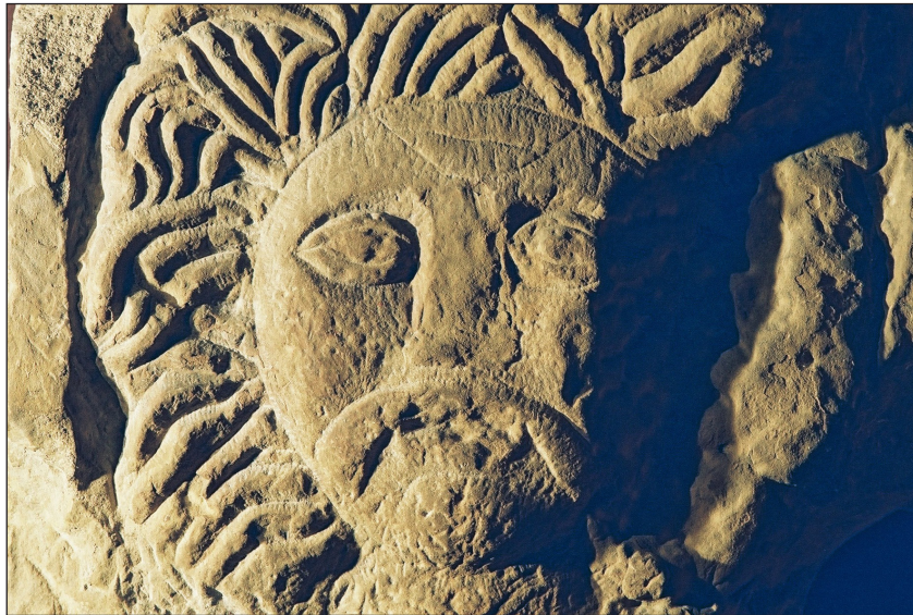
Figure 8: Relief labelled as a ‘Celtic god found at York’.