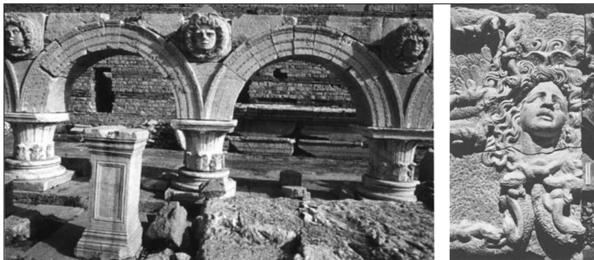
Figure 5: (Left) Medusa medallions on archways in the Severan Forum at Lepcis Magna (Cordovana 2012, Fig. 4. Reproduced with permission). (Right) Medusa on the West Gate Arch at Lepcis Magna (Ward-Perkins 1948, pl. IX. Reproduced with permission).

Medusas were also common in public contexts in the Roman world. The heads of Medusas and Nereids adorn the Forum porticoes of the Severan Forum of Lepcis Magna in modern-day Libya, as well as pilasters of the basilica, and the West Gate Arch (Ward-Perkins 1948: 74; Figure 5 ). Her association with the Nereids, in conjunction with the nearby nymphaea and the sea, again invokes her association with water. Ward-Perkins (1948: 74) argues the appearance of these Medusas suggests they were crafted in Aphrodisias in modern-day Turkey. Aphrodisias had its own Medusa heads, most notably in the Hadrianic Baths (Ward-Perkins 1948: 74). Medusas tend to be a common sight in baths throughout the Roman Empire and this, too, invokes her association with water.