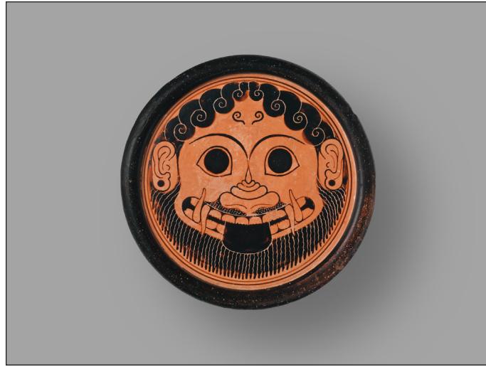
Figure 6: Archaic Greek Gorgoneion terracotta stand, c. 570 BC.